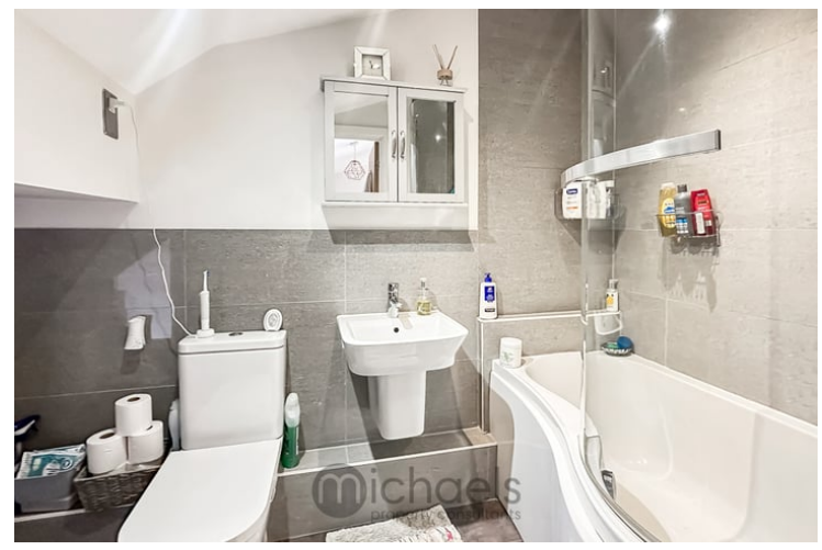
With 'P' shape bath featuring shower screen and shower, part tiled walls, wash hand basin, close coupled WC, tiled floor, heated towel rail, extractor fan, double glazed window.