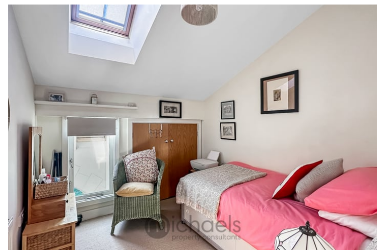
8'10" \times 8'0" (2.69m x 2.44m) With double window to rear, Velux window, fitted eaves storage.