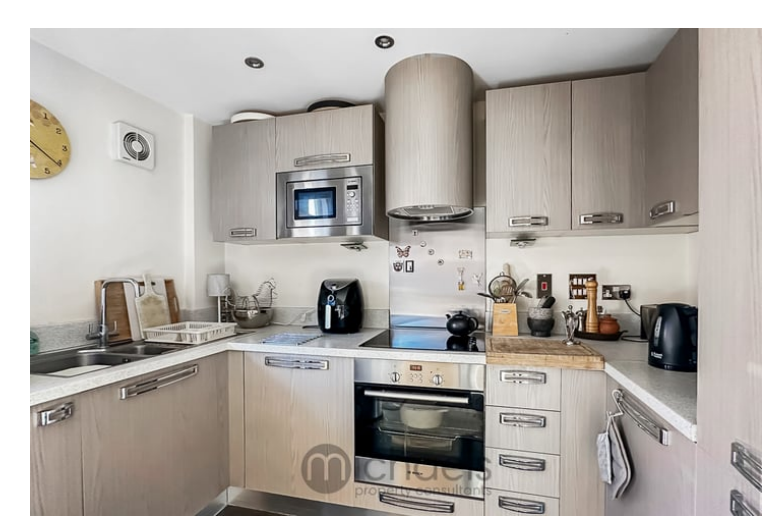
9'9" \times 5'9" (2.97m x 1.75m) With double glazed window, a range of matching eye level and base units with drawers and worktops over, inset sink and drainer, integrated appliances to include; fridge/freezer, dishwasher, fitted microwave, electric oven and hob, extractor hood over, stainless steel splashbacks, spotlights.