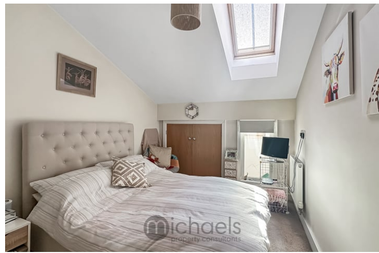
11'0" \times 8'8" (3.35m x 2.64m) With double glazed window to rear, Velux window, radiator, fitted eaves storage.