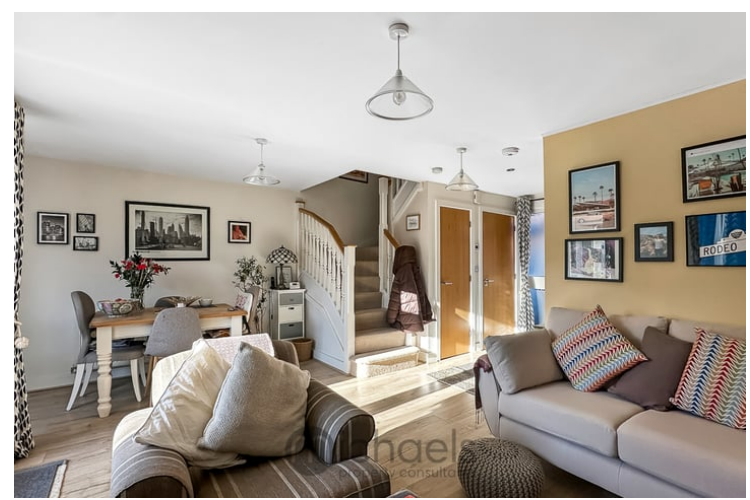
17'0" \times 15'5" (5.18m x 4.70m) With double glazed double doors to rear, two radiators, storage cupboard, TV point, stairs rising to first floor, door to utility/WC and open to;