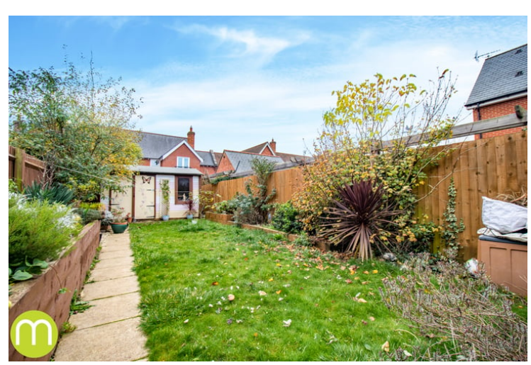
A beautiful enclosed rear garden measuring 45ft in length offering a patio area, lawn and a variety of sleeper beds, outside tap and summer house to remain.