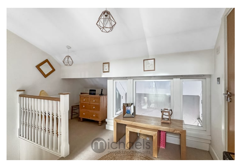
With low level double glazed windows, radiator, recess offering storage space, doors to;