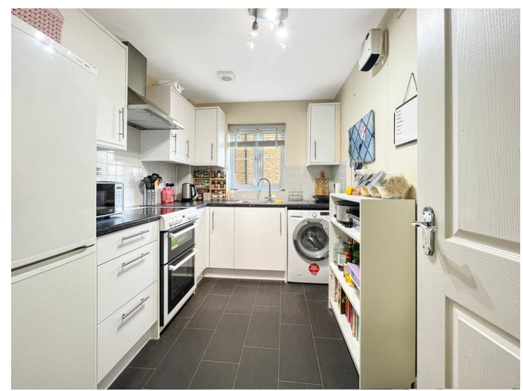
9' 9" x 7' 3" (2.97m x 2.21m)