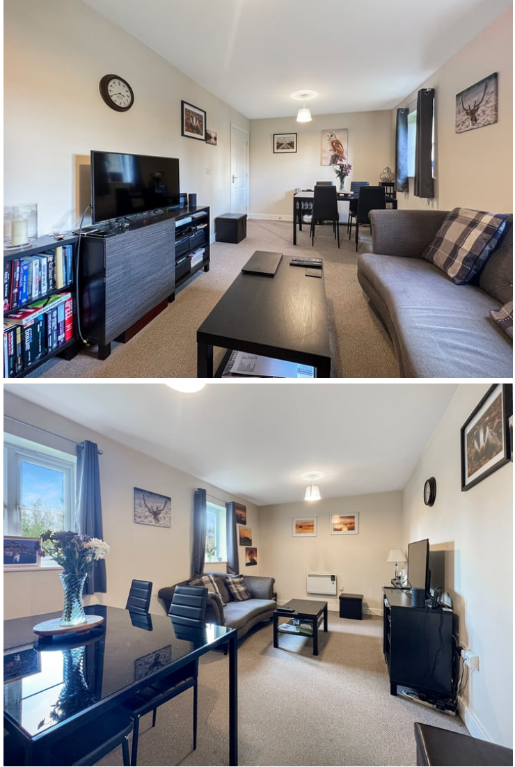
17' 3" x 9' 9" (5.26m x 2.97m)