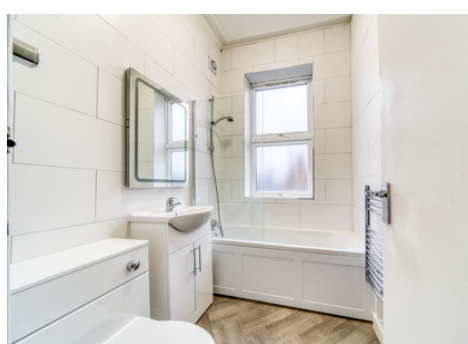
Clyde Road, Croydon, Surrey, CR0