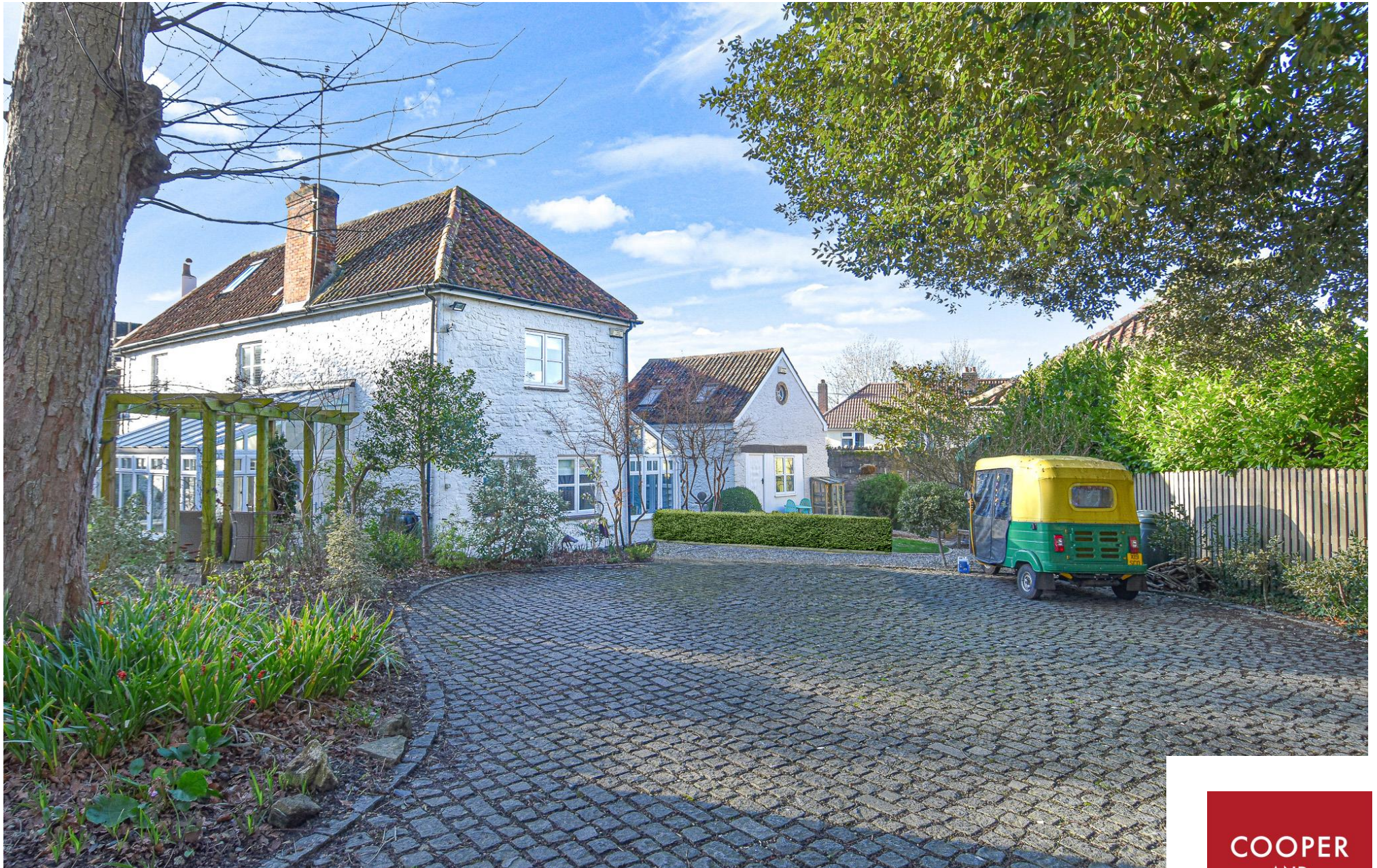
The Old Coach House, Sand Road, Wedmore BS28 4BZ