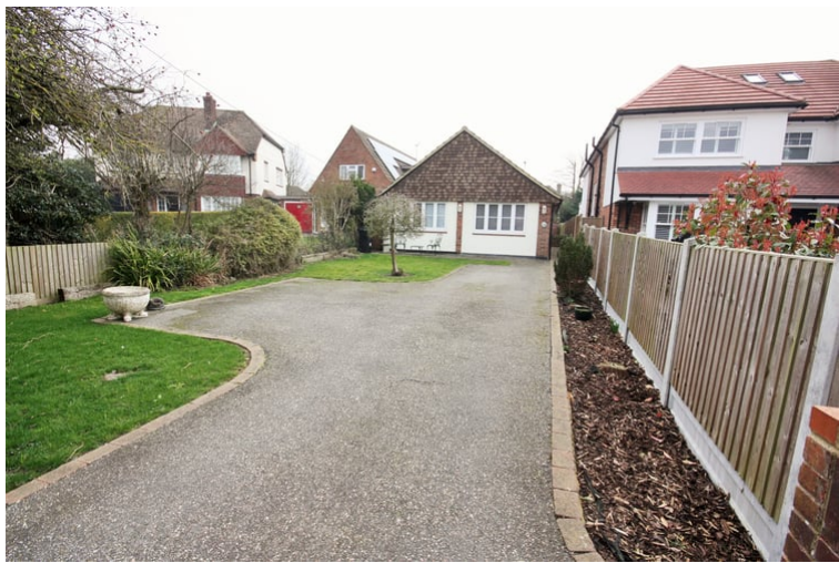
Driveway with space for multiple vehicles.

The Agents not tested any apparatus, fixtures and fittings, or services, so cannot verify that they are in working order or fit for the purpose. The buyer is advised to obtain verification from his or her Professional Adviser. Refernces to the Tenure of the property are based on information supplied by the Vendor. The agent has not had sight of the title documents. The buyer is advised to obtain verification from their Solicitor. You are advised to check the availability of any property before travelling any distance to view.