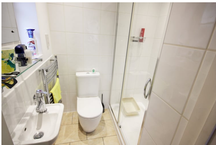
En Suite Shower Room