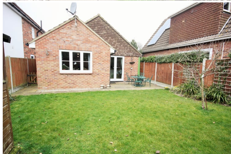
Patio area with remainder laid to lawn. Side access both sides.