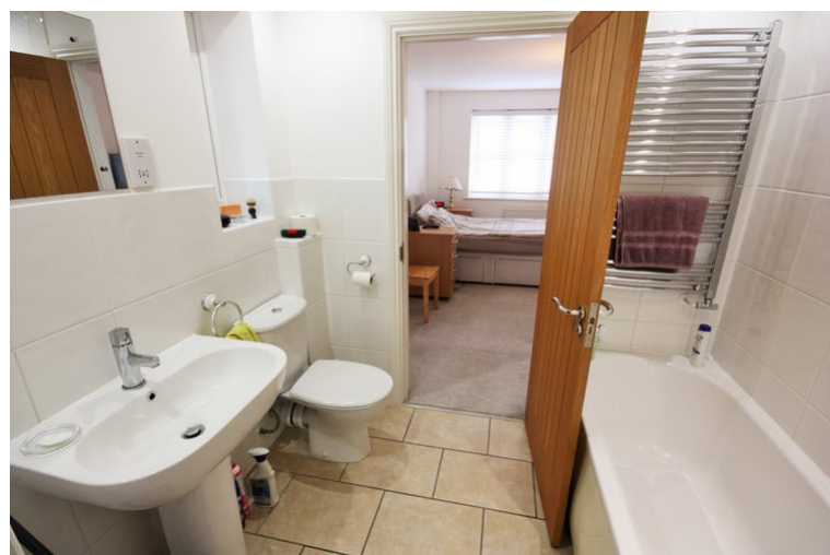
Jack & Jill Bathroom