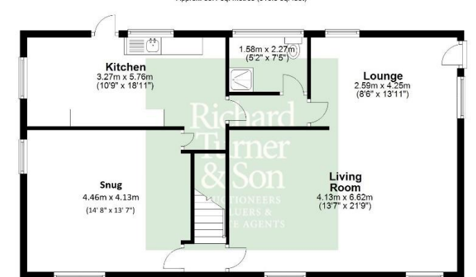
First Floor Approx. 65.1 sq. metres (700.4 sq. feet)