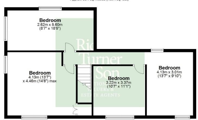
Total area: approx. 150.2 sq. metres (1616.7 sq. feet) For illustration purposes only, not to scale. Plan produced using Plantly.