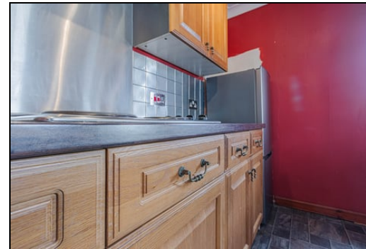
3.20m x 2.40m (10' 6" x 7' 10")