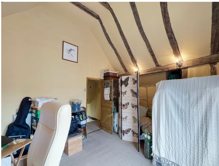
14' 0" x 13' 6" (4.27m x 4.11m)