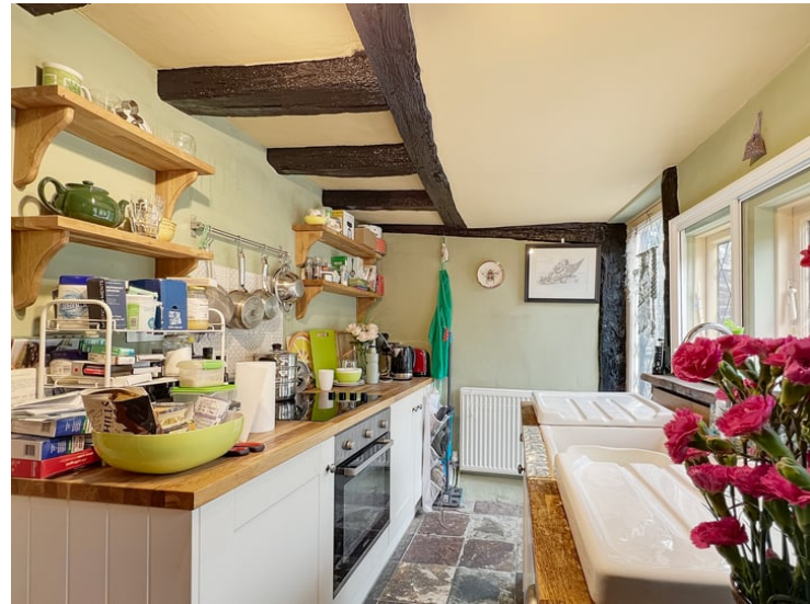
10' 5" x 6' 2" (3.18m x 1.88m)