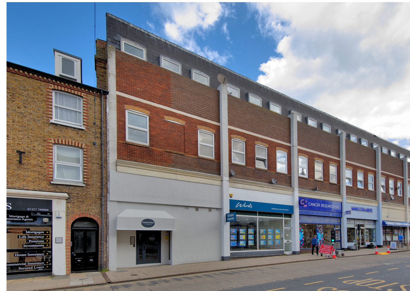
Flat 12 Frances Court 117 High Street, Heme Bay, Kent, CT6 5LA