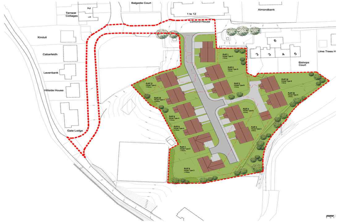
Ordinance Survey, (c) Crown Copyright 2015. All rights reserved. Licence number 100022432