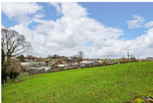
VIEWS TO THE REAR

TENURE We are informed the tenure is Freehold.