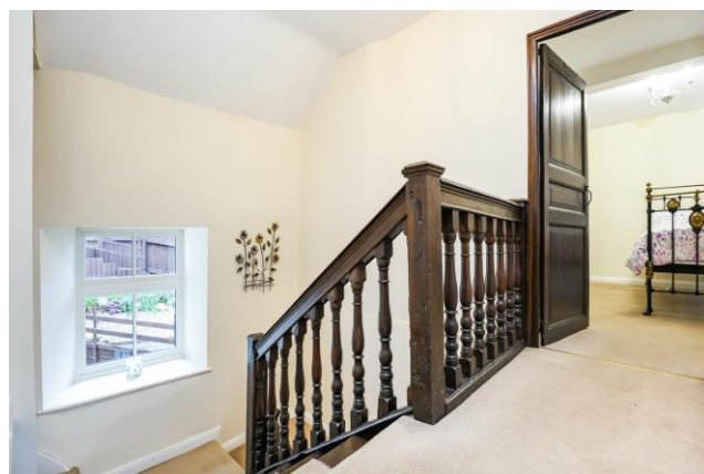
STAIRCASE & LANDING