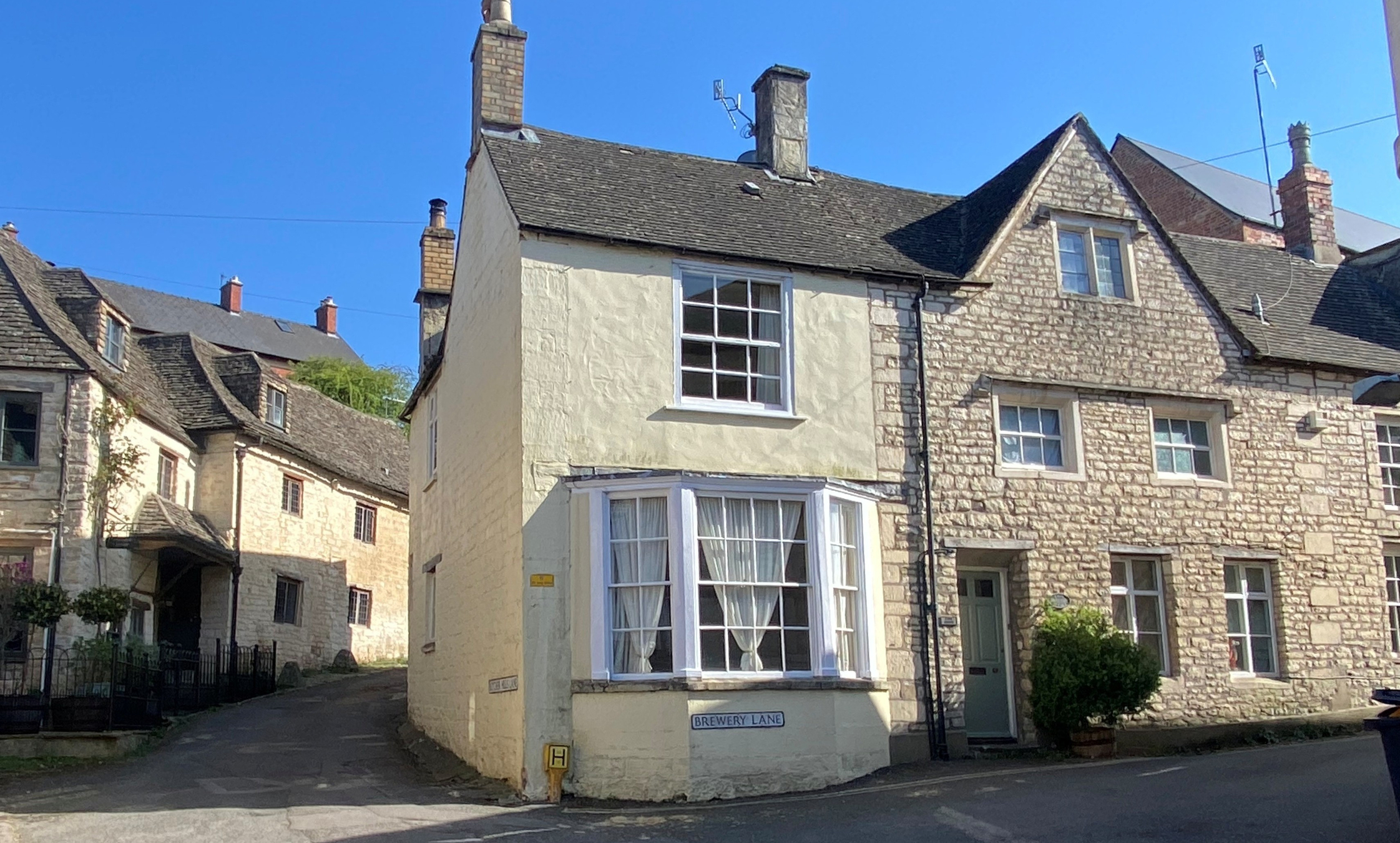
Lion House, Brewery Lane, Nailsworth, Gloucestershire, GL6 0JQ £350,000