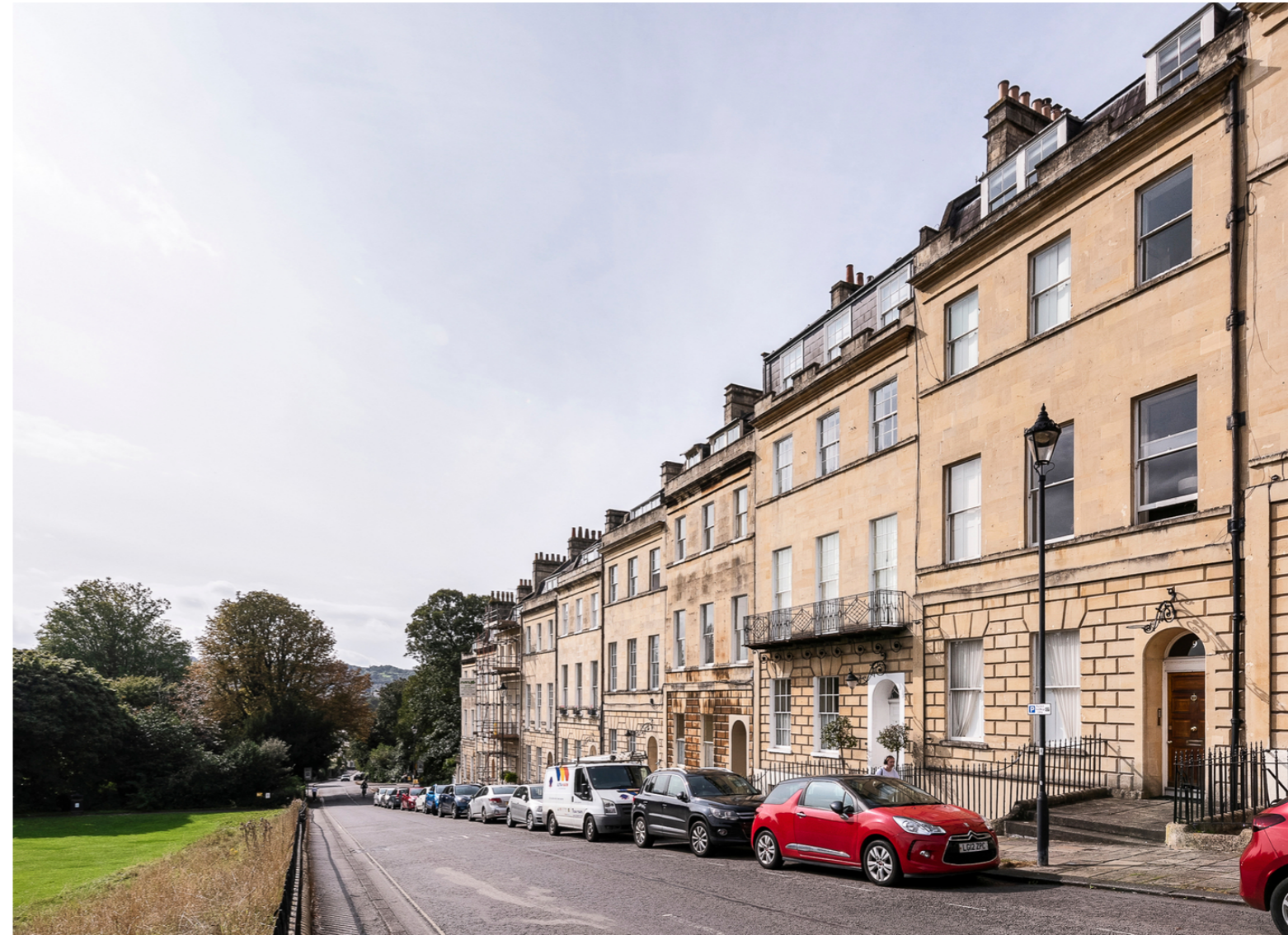
Marlborough Buildings, Bath