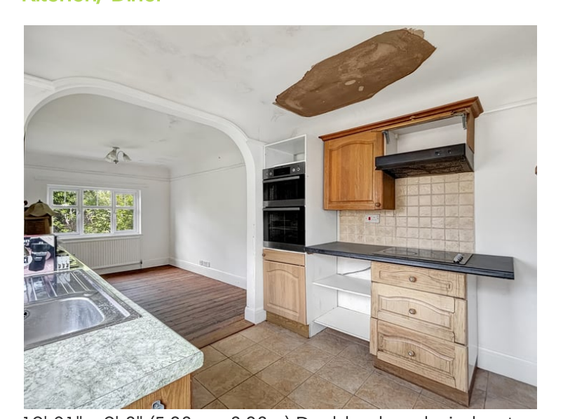
19' 01" x 9' 3" (5.82m x 2.82m) Double glazed window to side and rear, UPVC side door, radiator, tiled floor, fitted kitchen including a range of wall and base units, laminate worktops, integrated AEG double oven, electric hob, stainless steel sink, wall mounted boiler, space for fridge/freezer and washing machine.