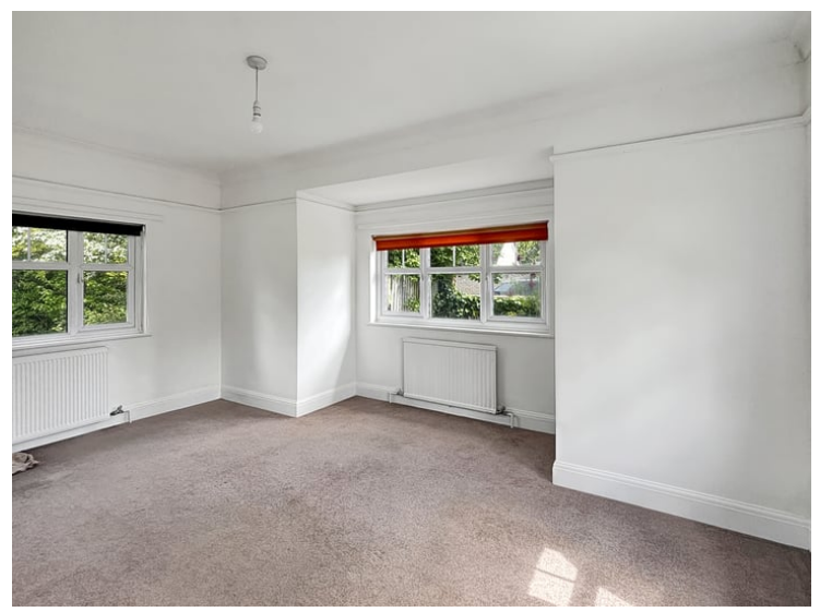
11' 4" x 8' 4" (3.45m x 2.54m) Double glazed window to front and rear, box bay to side, radiator.