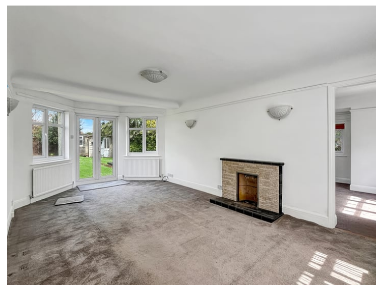
20' 3" x 11' 11" (6.17m x 3.63m) Double glazed window to front and French doors to rear, fireplace, radiator.