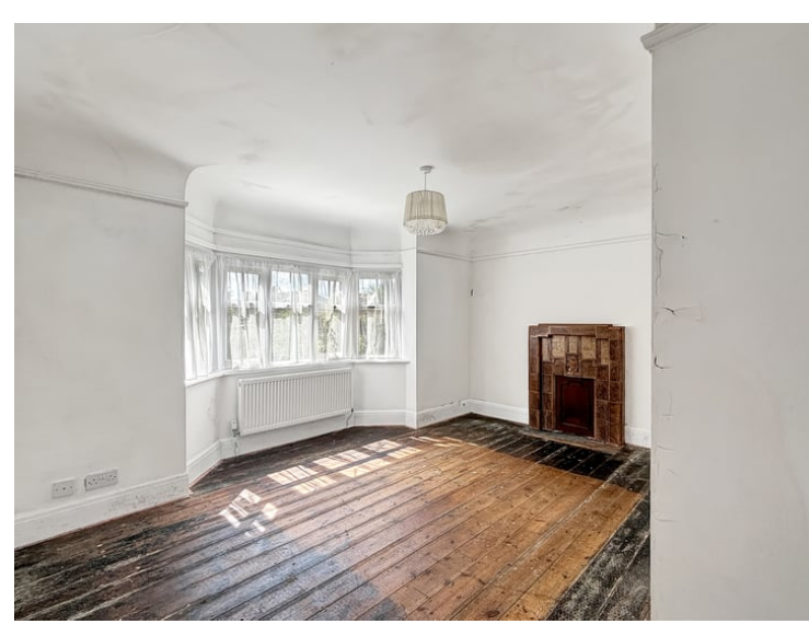
14' 09" \times 9' 0" (4.50m \times 2.74m) 14' 09" \times 9' 0" (4.50m \times 2.74m) Double glazed bay fronted window to front, radiator, fireplace.