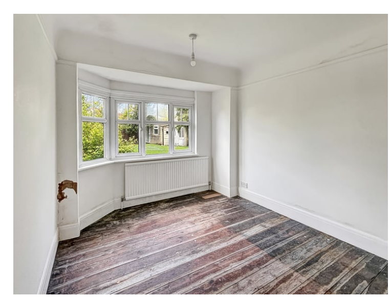
9' 6'' x 9' 3'' (2.90m x 2.82m) Double glazed window to rear, radiator.