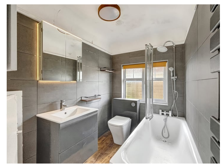
9' 6" x 5' 6" (2.90m x 1.68m) Double glazed obscure window to side, vertical radiator, tiled walls, loft access, fitted suite including vanity unit, low level WC, paneled bath with bi folding shower screen and over head shower.