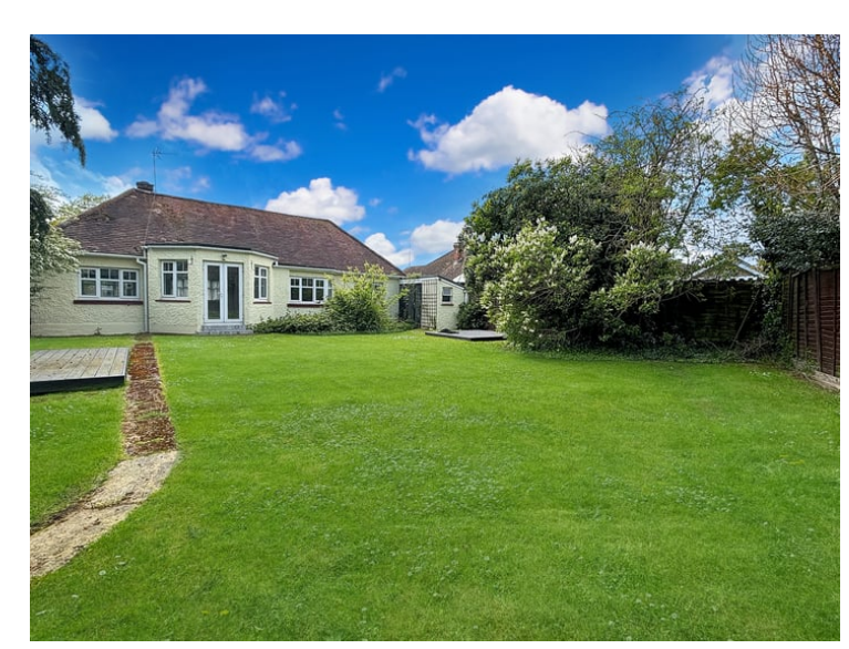
Mainly laid to lawn a beautifully rear garden including decking areas, out buildings, retained by fencing, trees and mature shrubs.