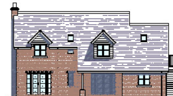
Rear (E) Elevation