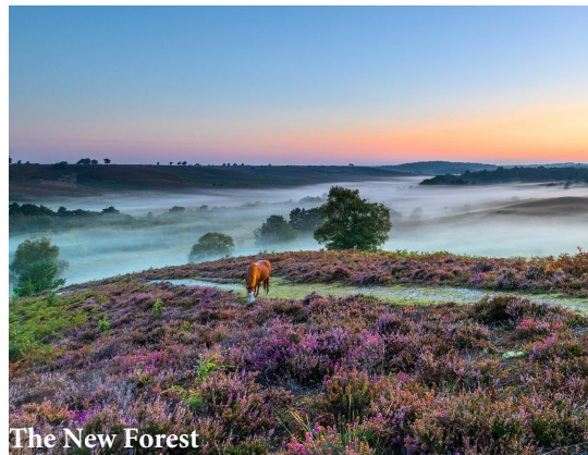
The New Forest