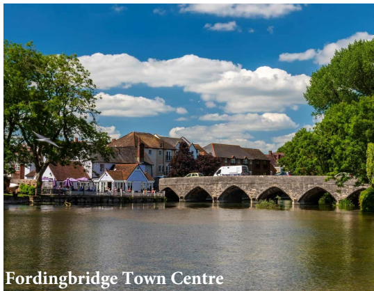
Fordingbridge Town Centre