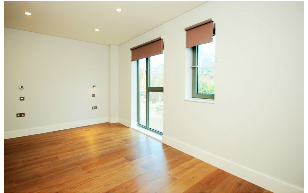
Waterside Apartments, 537 Harrow Road, North Kensington, LONDON W10 4RH £3,750 pcm