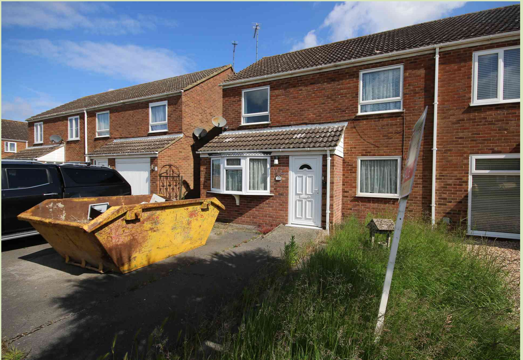
10 The Burnhams, Terrington St Clement Guide Price £225,000