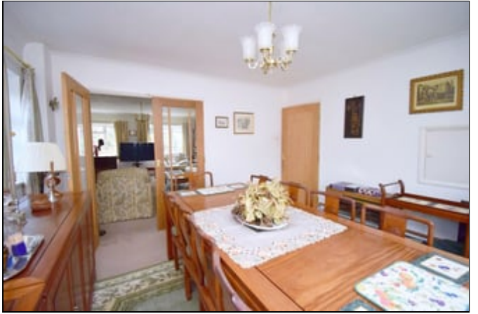
12' 8" x 12' 0" (3.86m x 3.66m)

Moving through the lounge, one is greeted with a dining space large enough to seat twelve. Two UPVC sealed unit double glazed windows to the side, with frosted glass, accompany the service hatch to the kitchen, covered cornice and large double doors into the conservatory.