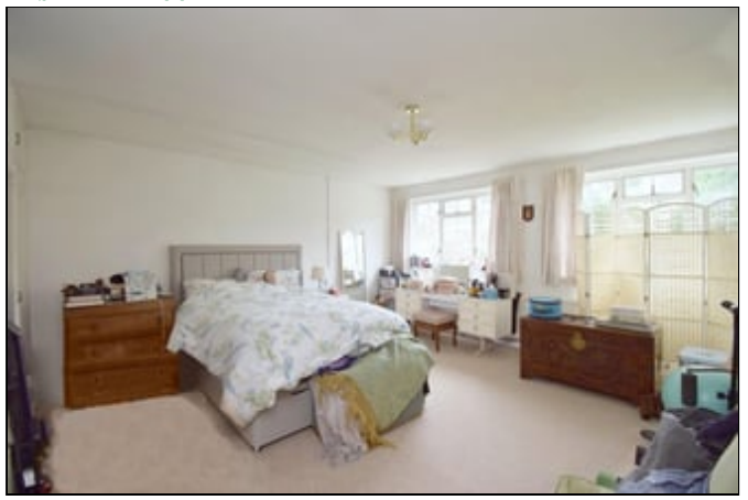
15' 11" x 14' 11" (4.85m x 4.55m)

Presenting plenty of integrated storage, with two built in double wardrobes, built in bedhead with shelved cupboards to either side, and a further build in wardrobe cupboard. The two large UPVC sealed unit double glazed windows to the South facing front make the room extremely bright, accentuating its capaciousness.