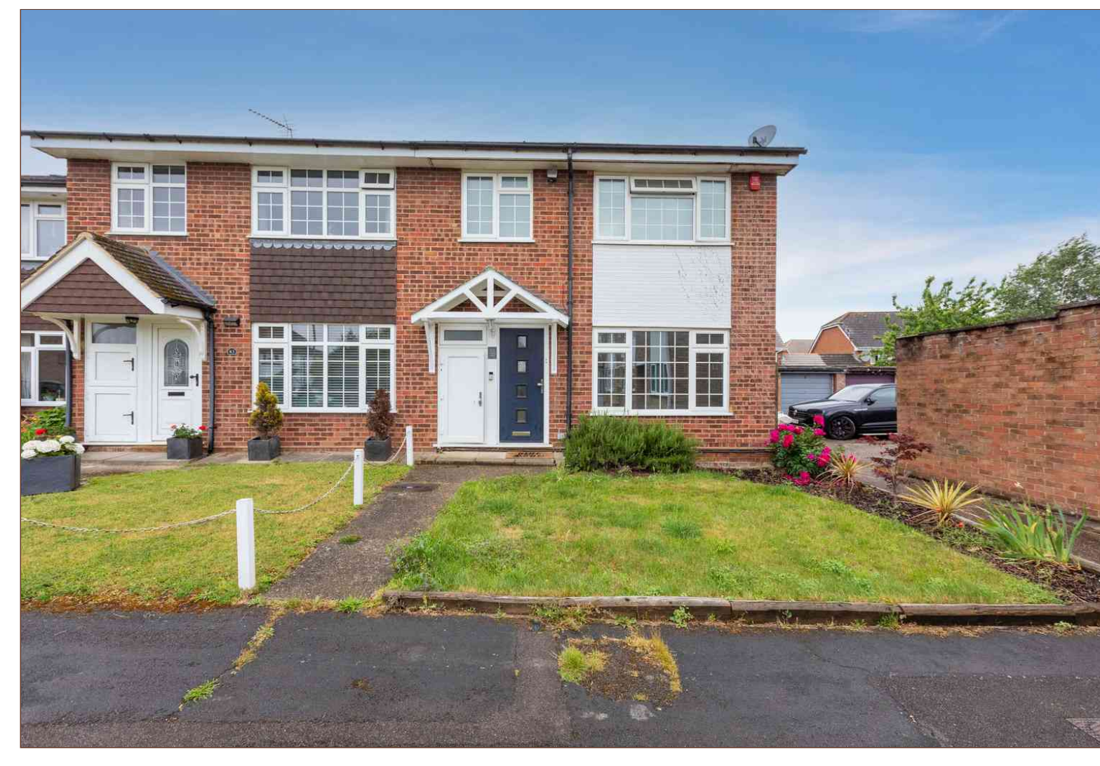
Tockley Road is a lovely quiet residential cul de sac located within walking to Burnham Village High Street. This area is extremely is popular with families of all ages due to the close proximity to a number of excellent schools, the main of which is Burnham Grammar School, located only 0.6 miles away.

This FREEHOLD home has been beautifully decorated throughout and is ready for the next owners to move straight in. The ground floor comprises of a spacious family lounge and stunning open plan kitchen/diner. The kitchen/diner has patio doors which opens up into the private rear garden and ensures that the ground floor is flooded with natural light. A downstairs WC completes the ground floor. On the first floor you will find all THREE spacious bedrooms and the main family bathroom.