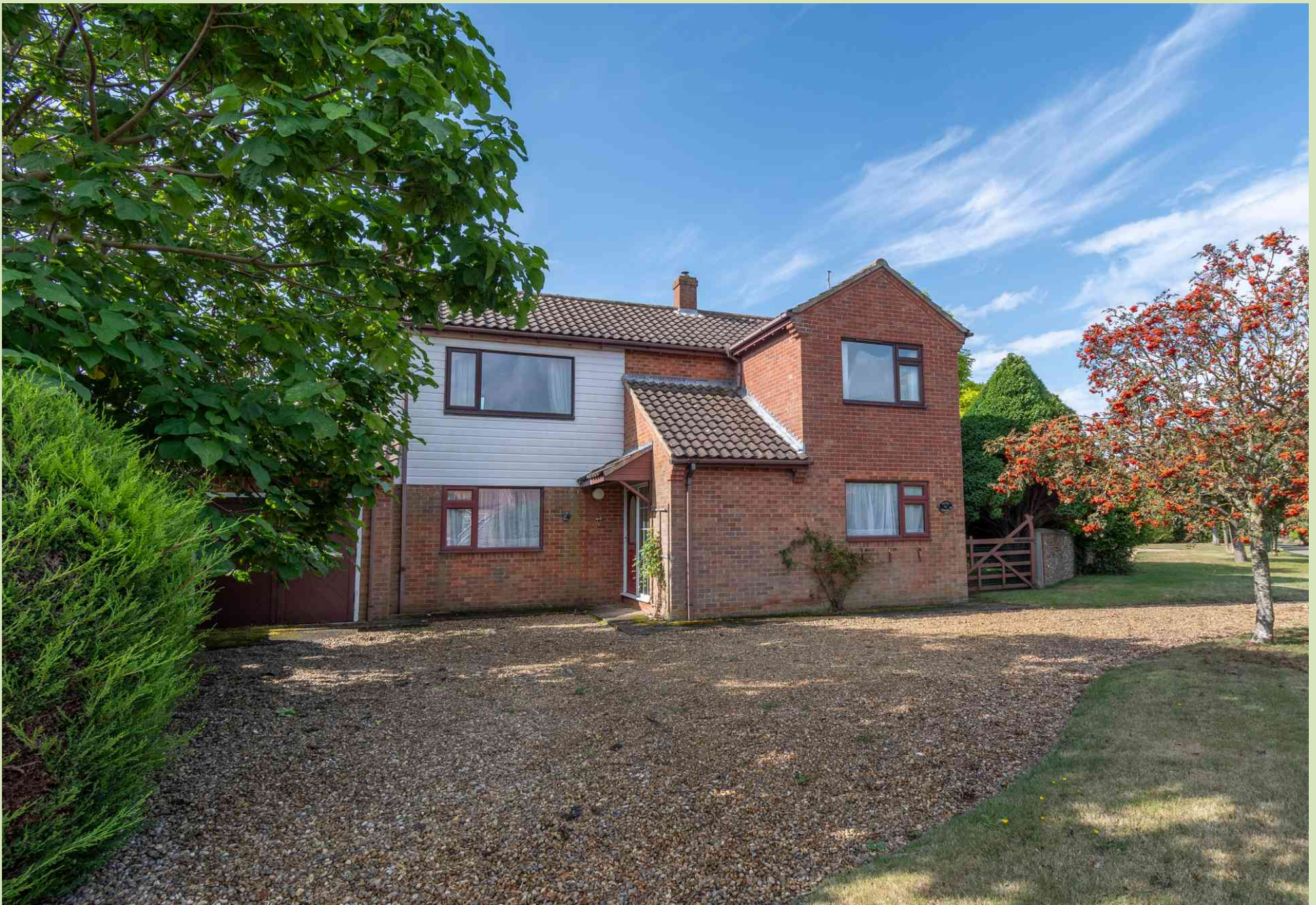
Sandpipers, Brancaster Guide Price £600,000