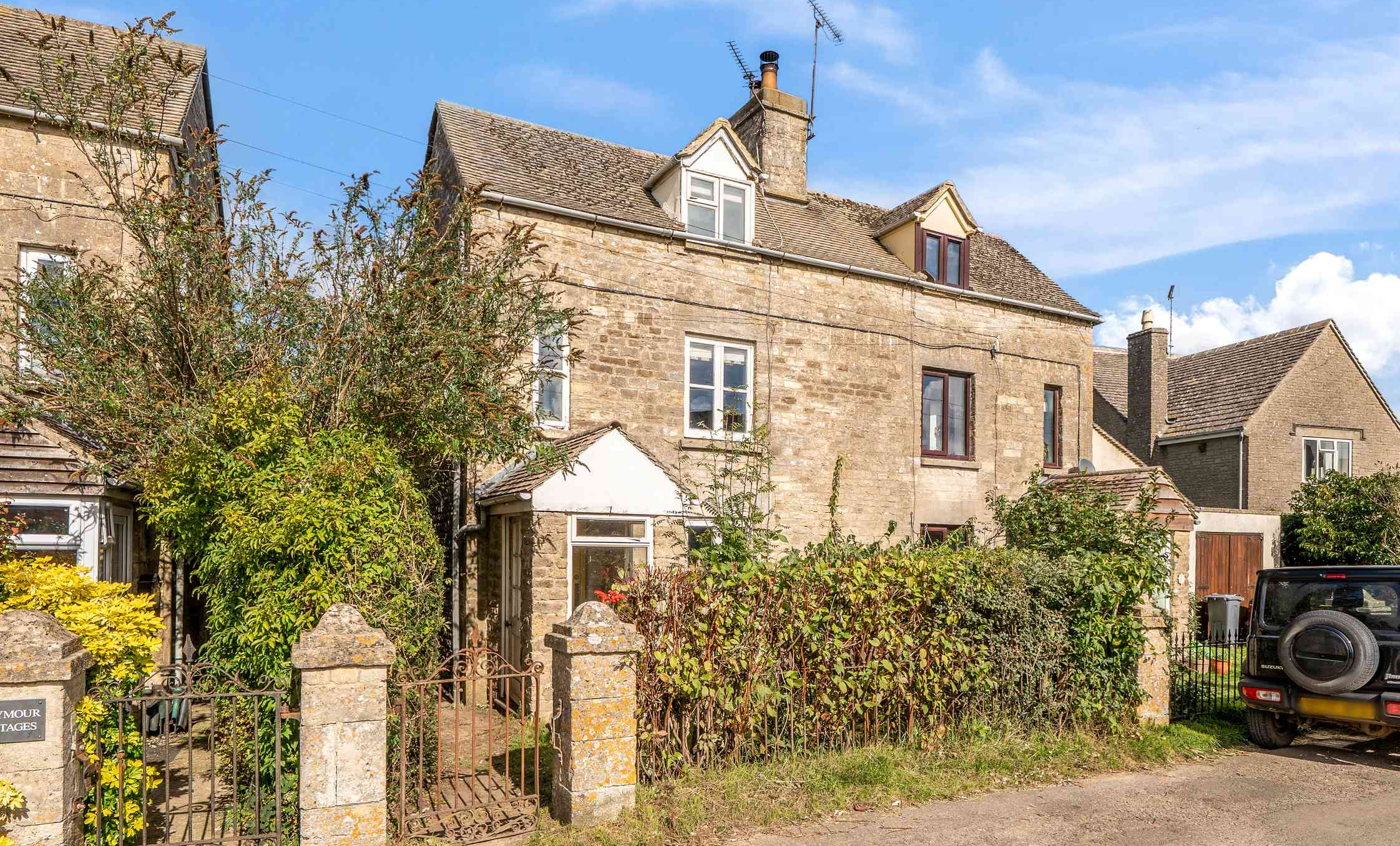
1 Stratford Cottages, Van Der Breen Street, Bisley, Gloucestershire, GL6 7BP £425,000