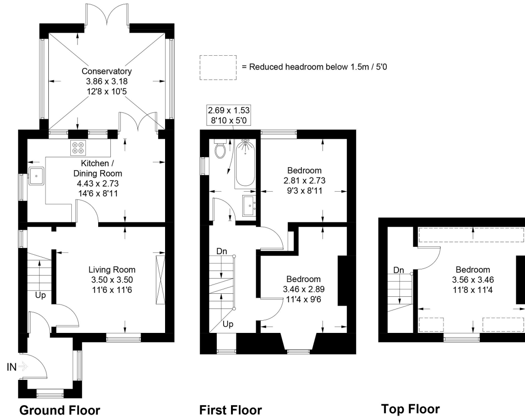
Illustration for identification purposes only, measurements are approximate, not to scale. Fourlabs.co © (ID1244686)