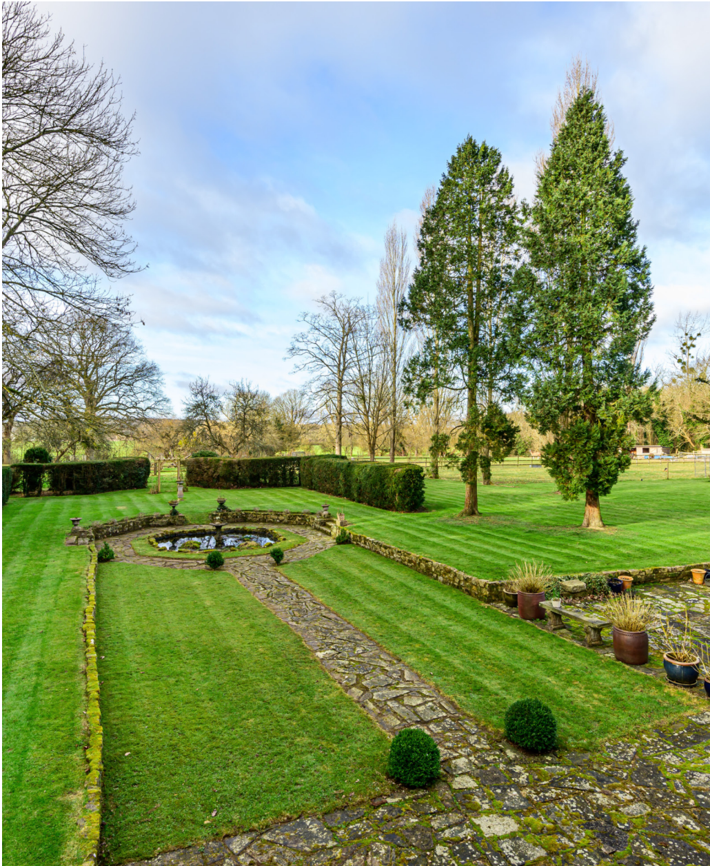
Saxley Hill Barn