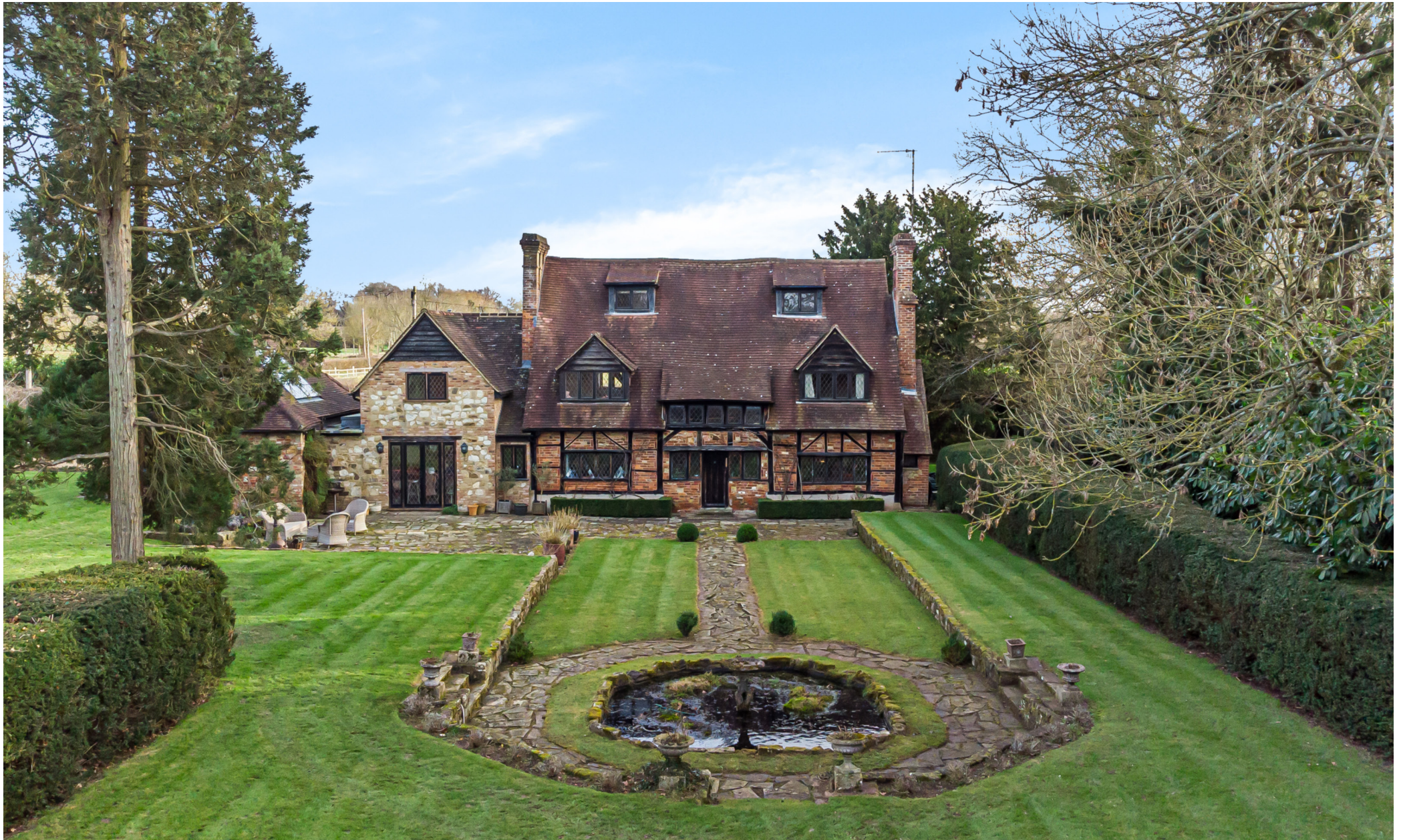
Saxley Hill Barn, Meath Green, Surrey