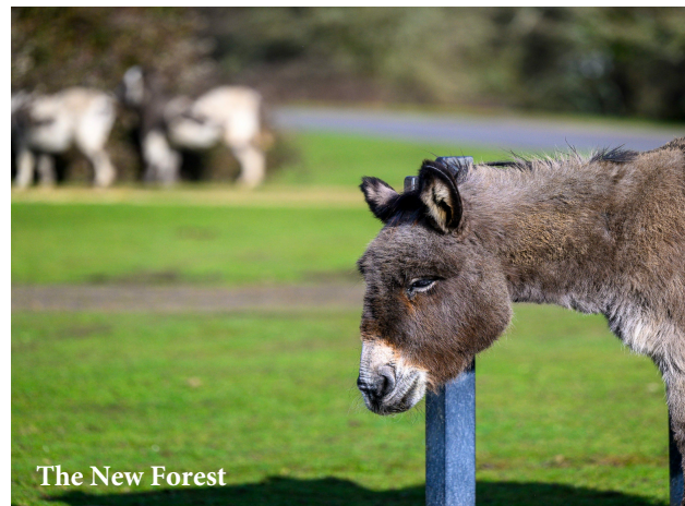
The New Forest