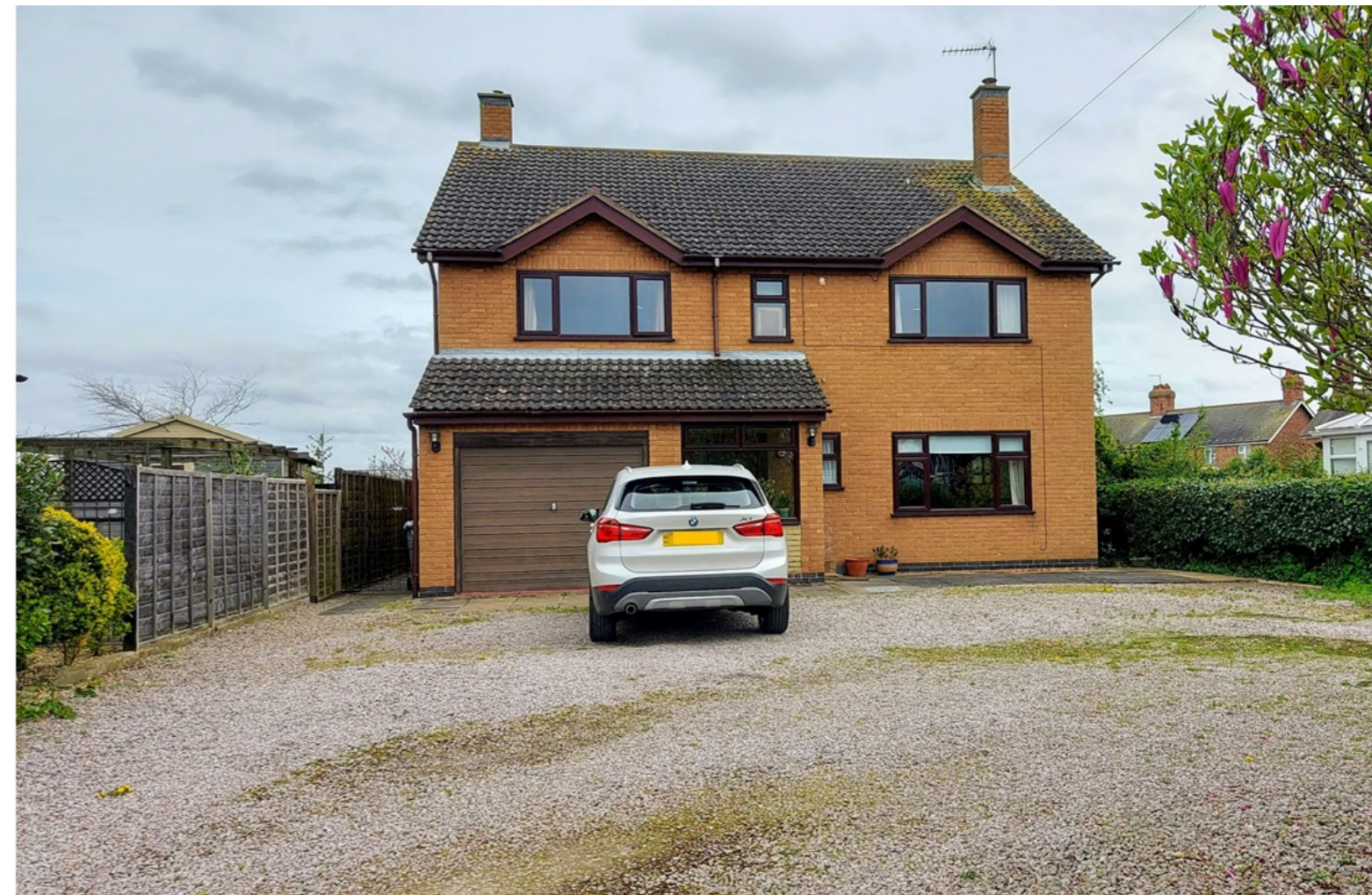
7 Saffron Lodge, Main Road, Dowsby, Bourne, Lincolnshire PE10 0T£350,000