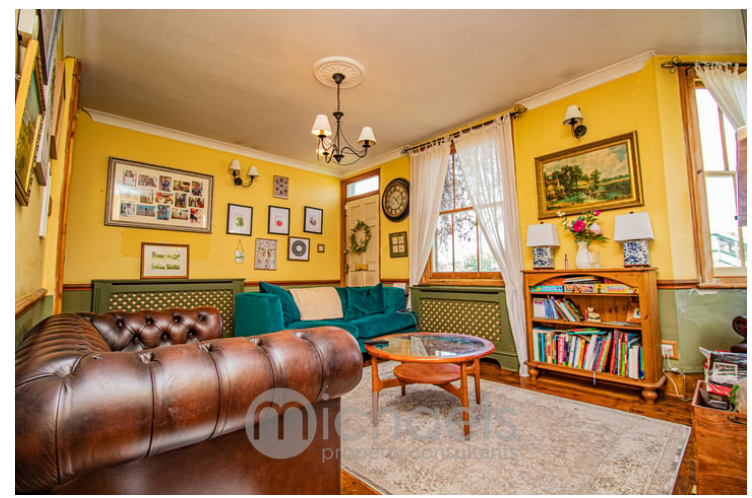
15' x 10' 10" (4.57m x 3.3m)