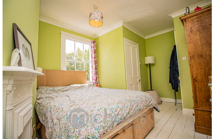
12'11" x 10'6" (3.94m x 3.2m)