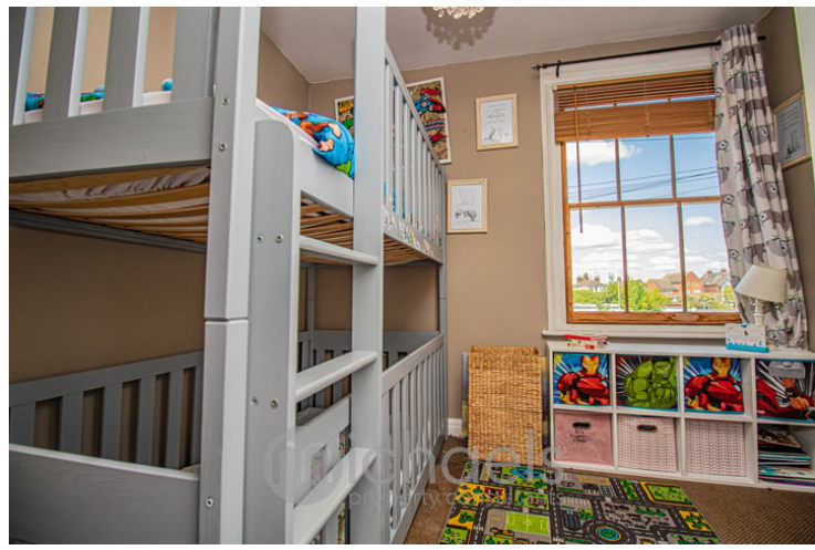
9' 5" x 8' (2.87m x 2.44m)