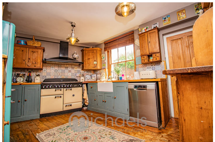
14' x 10' 2" (4.27m x 3.1m)