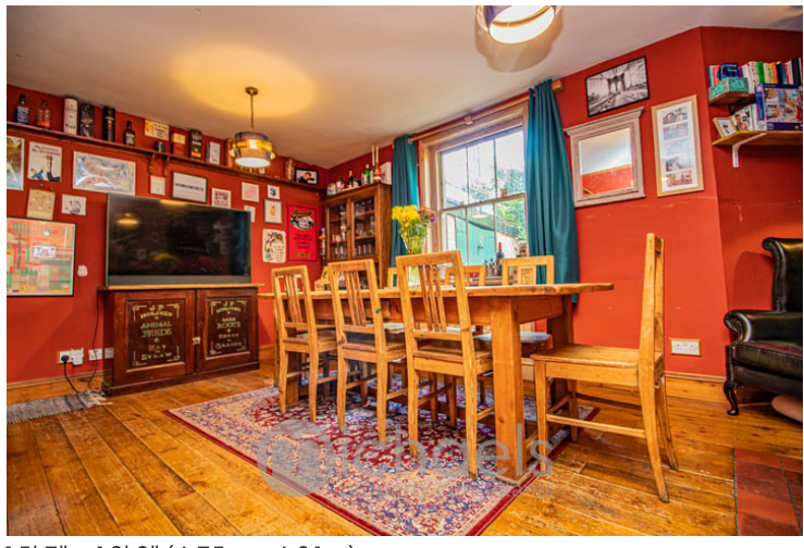
15' 7" x 13' 2" (4.75m x 4.01m)