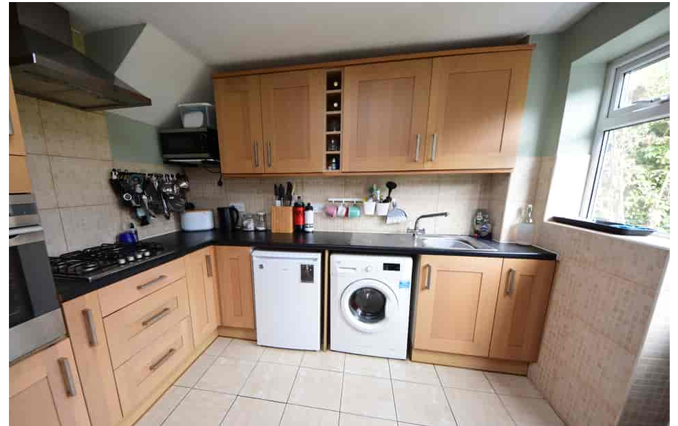
14 Kensington Close, Kings Sutton, Northamptonshire. OX17 3XB Guide Price £315,000 - Freehold