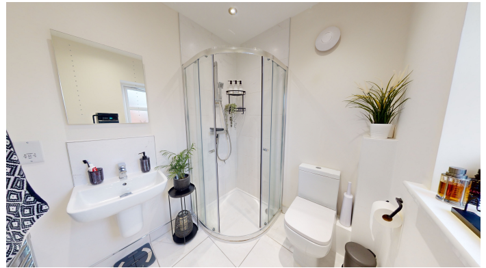
Second Bedroom With En Suite