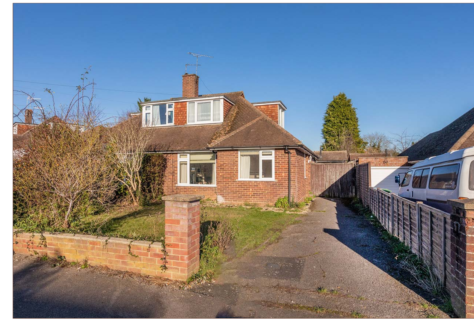
Offered for sale with NO ONWARD CHAIN, this three bedroom, semi detached bungalow is situated in the ever popular location close to Newlands Girls school, local shops and The National Trusts Pinkney's Green.

The front door leads to a spacious ENTRANCE HALL with doors to all rooms and stairs to the first floor bedroom. The Living Room overlooks the front garden and has a feature gas fire place. The Kitchen overlooks the private rear garden and is fitted with a range of floor and wall mounted units set to ample work top incorporating the sink unit. There is a door to the side and plenty of space for a kitchen table. On the ground floor there is also TWO BEDROOMS, a FAMILY BATHROOM and separate WC. Upstairs is the Primary Bedroom with lovely views over town.