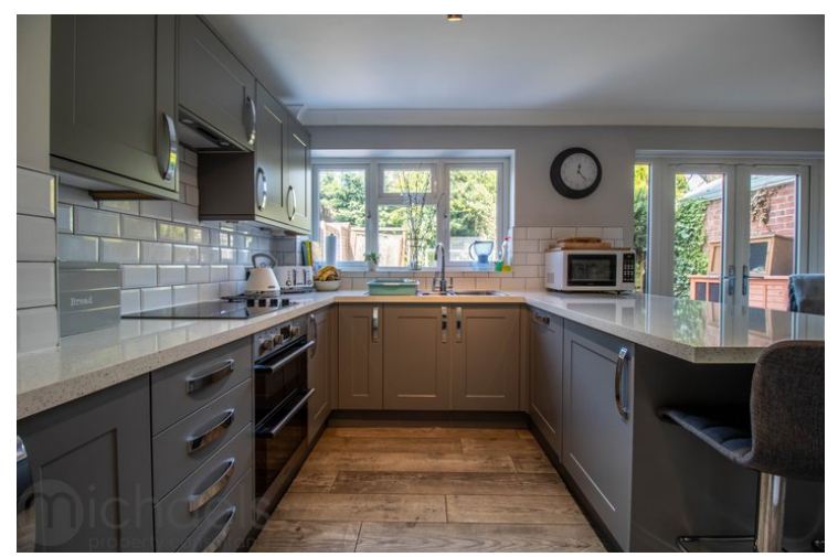
16' 11" x 12' 5" (5.16m x 3.78m) With UPVC double glazed window and French doors to rear, radiator, a range of matching contemporary eye level and base units with square edge worktops over, inset one and a half sink and drainer, breakfast bar, in-built oven and hob with extractor hood, integrated dishwasher and fridge/freezer.