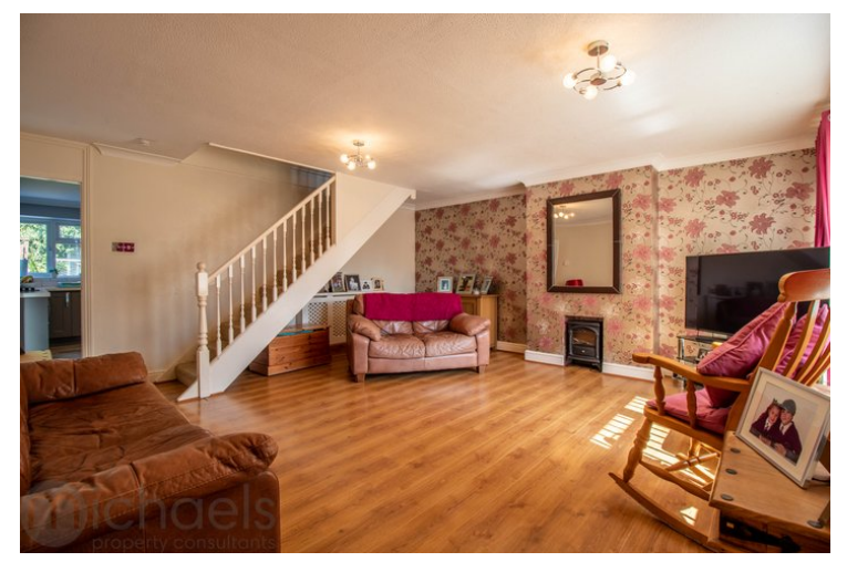
16' 11" \times 16' 8" (5.16m \times 5.08m) With UPVC double glazed window to front, radiator, stairs to first floor, door to;