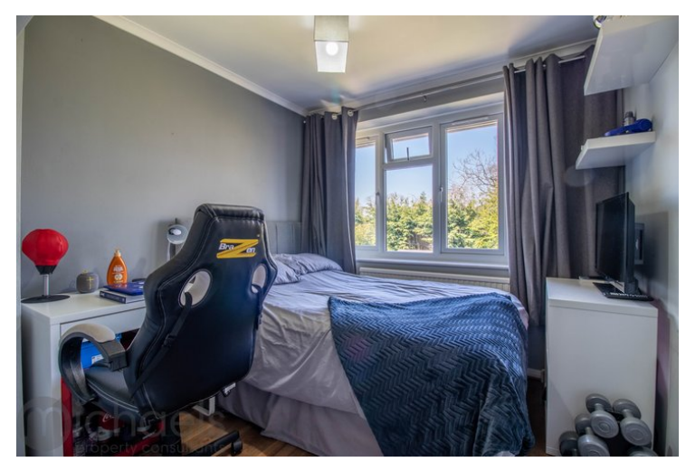
9' 7" x 8' 3" (2.92m x 2.51m) With UPVC double glazed window to rear, radiator, built in cupboard.