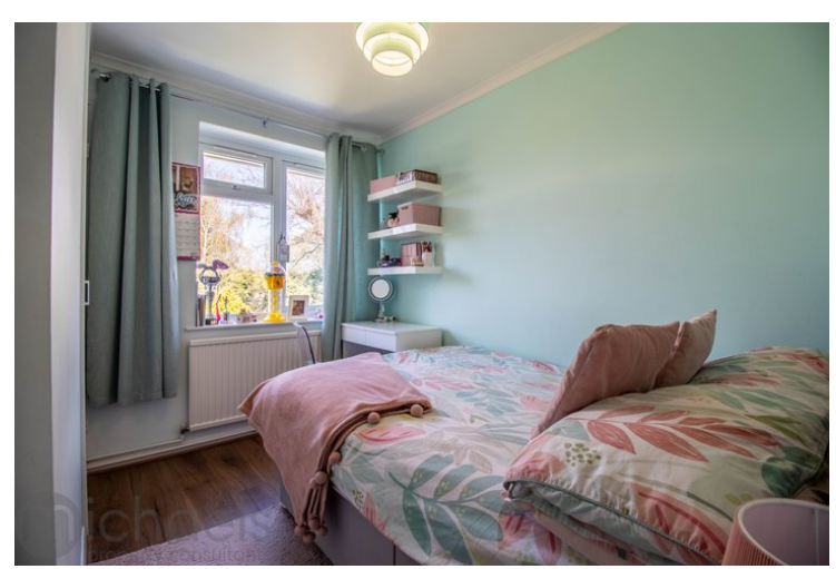
9' 6" x 8' 6" (2.90m x 2.59m) With UPVC double glazed window to rear, radiator, built in cupboard.