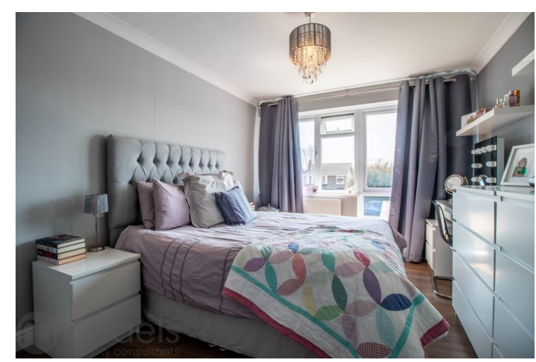
13' 7" \times 10' 0" (4.14m x 3.05m) With UPVC double glazed window to front, radiator.