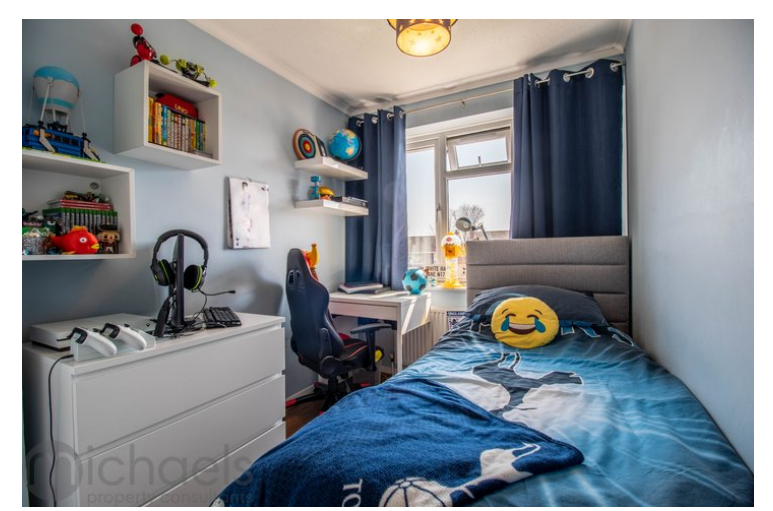
10' 8" \times 6' 10" (3.25m \times 2.08m) With UPVC double glazed window to front, radiator, built in cupboard.