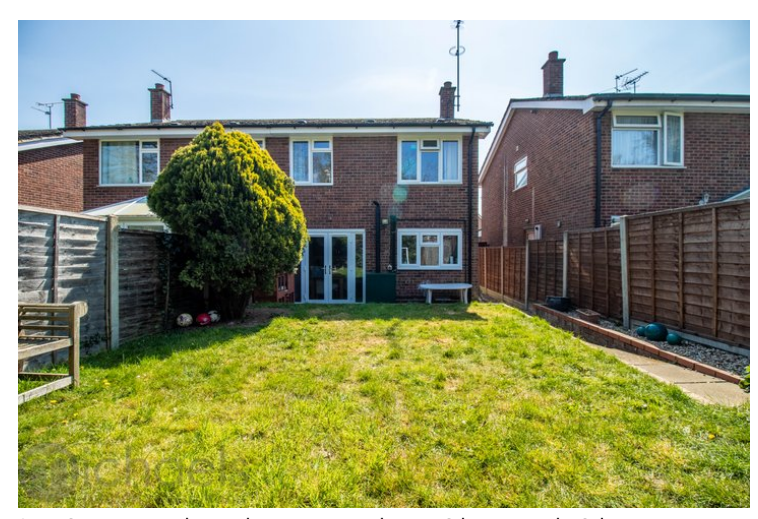
A private enclosed rear garden with gated side access.