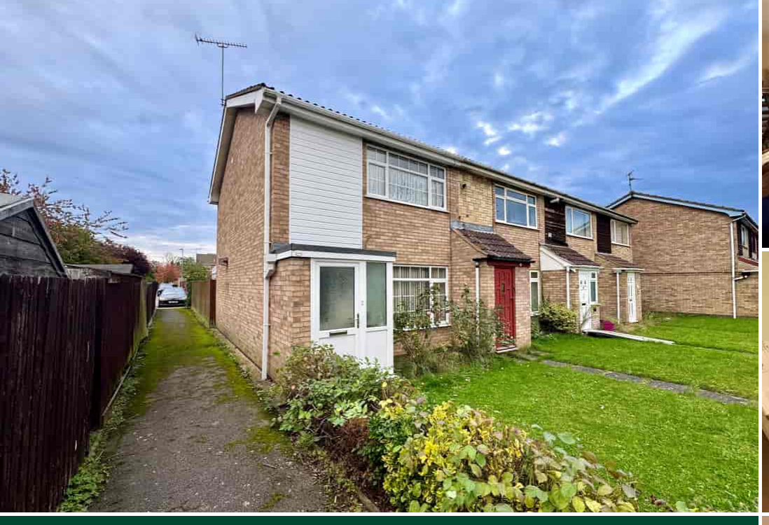
48 Langley, Bretton, Peterborough PE3 8QB