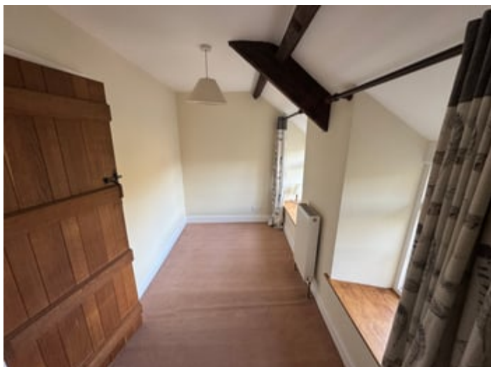
13' 3" x 6' 8" (4.04m x 2.03m) With exposed beams, double aspect windows and a radiator.