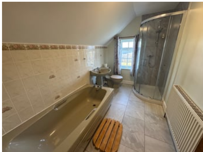
10' 5" x 6' 5" (3.17m x 1.96m) A four piece suite comprising of a panelled bath, pedestal wash hand basin, shower cubicle and a low level flush W.C. Tiled flooring and part tiled walls. Radiator.