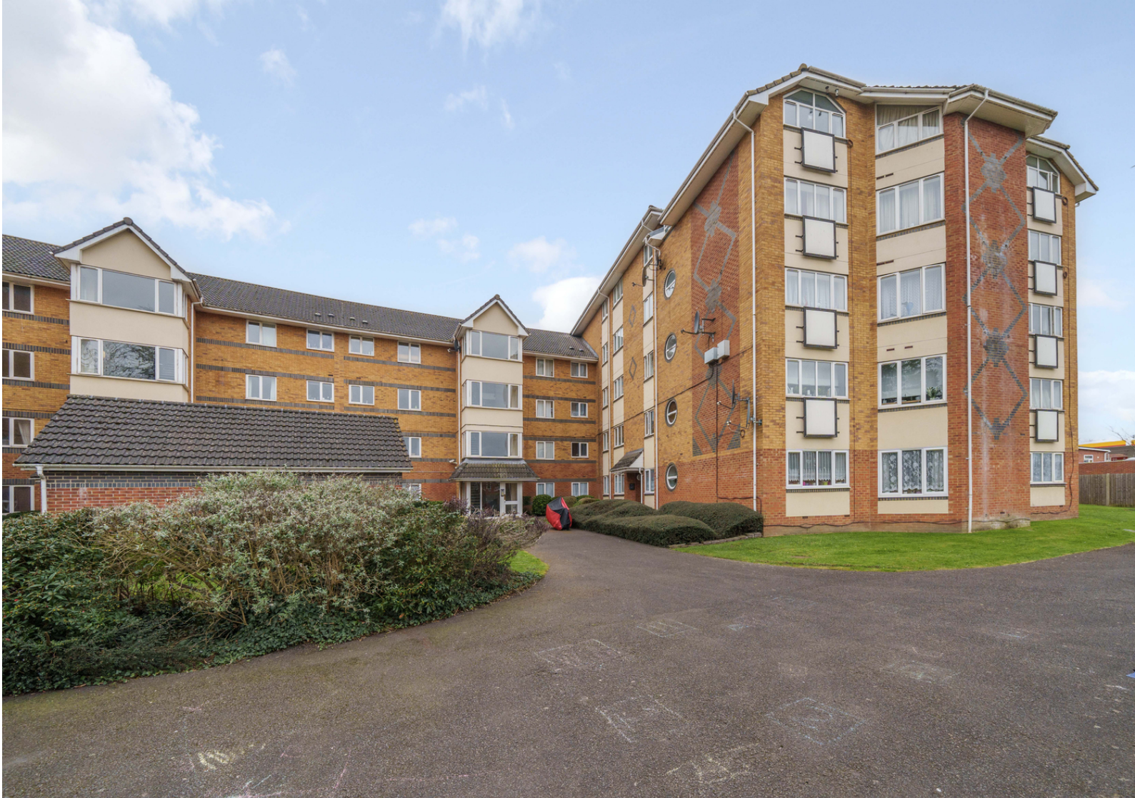
Oxford Road, Reading, Berkshire. RG30.