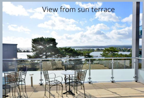
View from sun terrace