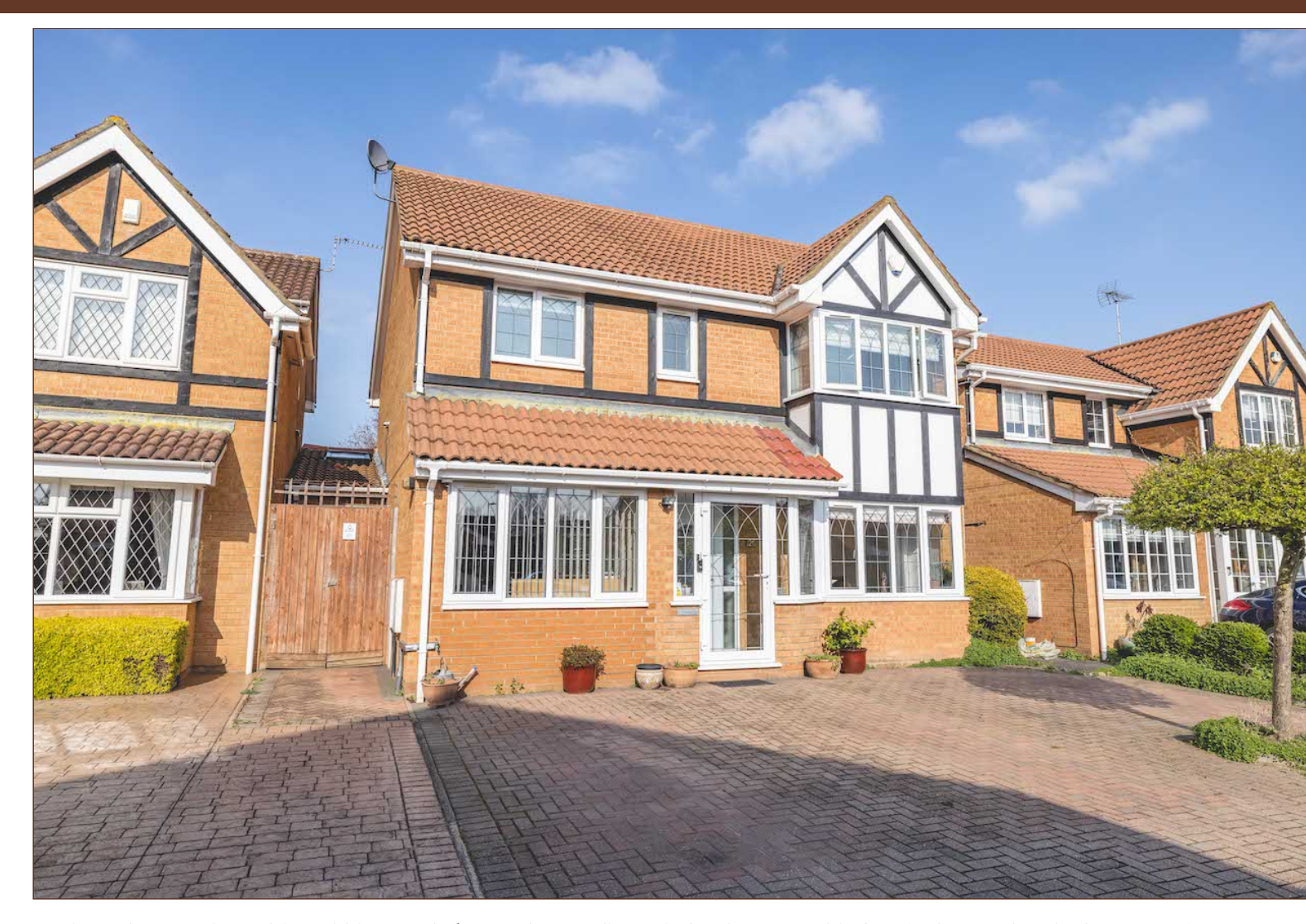
Situated on a private drive within Langley's popular Maplin Park development, this four bedroom detached property boasts side and rear extensions, creating spacious and adaptable living accommodation, suitable for a large family.

Stretching an exceptional 2282 square feet, the ground floor comprises two reception rooms including a bay-fronted family room and 22ft living room/diner enjoying all day sunlight via skylight window and patio doors opening to the rear garden. The kitchen offers an excellent range of fitted units and breakfast bar and some integrated appliances, all complemented by granite worktops.