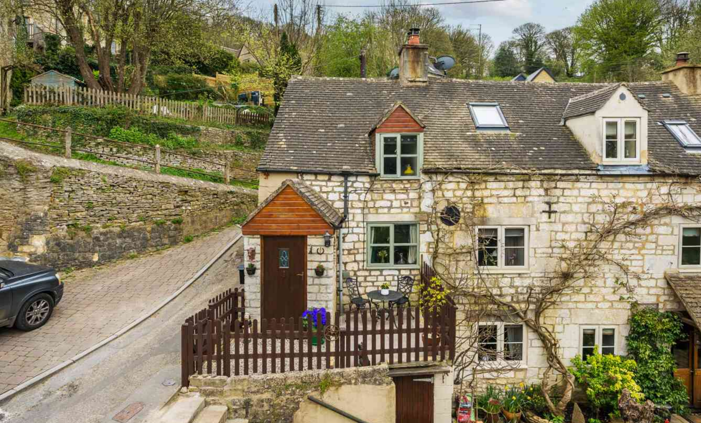
The Anchorage, Harley Wood, Nailsworth, Gloucestershire, GL6 0LB £200,000