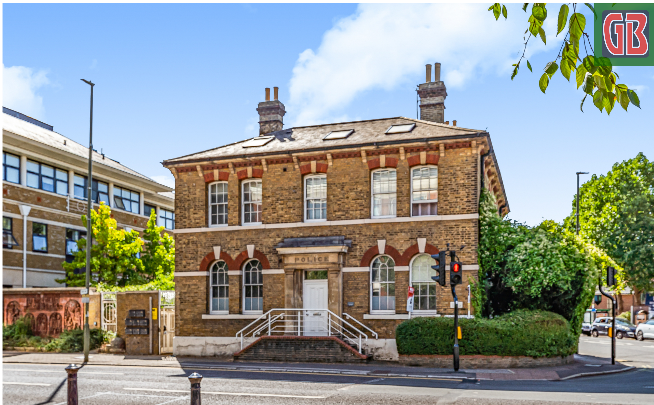
Flat 3, 2 The Old Police Station, London Road, Staines-upon-Thames. TW18. 1 Bedroom Apartment - £225,000 Leasehold