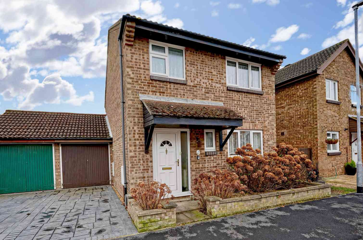
Wheatsheaf Road, Alconbury Weston PE28 4LF