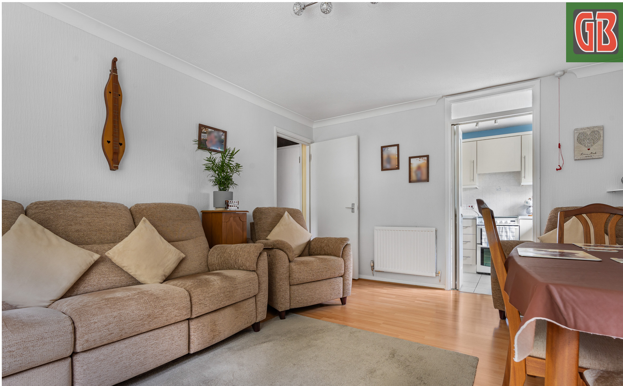
6 The Doultons, Octavia Way, Staines-upon-Thames, Surrey. TW18 2QX. 1 Bedroom Retirement Property - £135,000 Leasehold