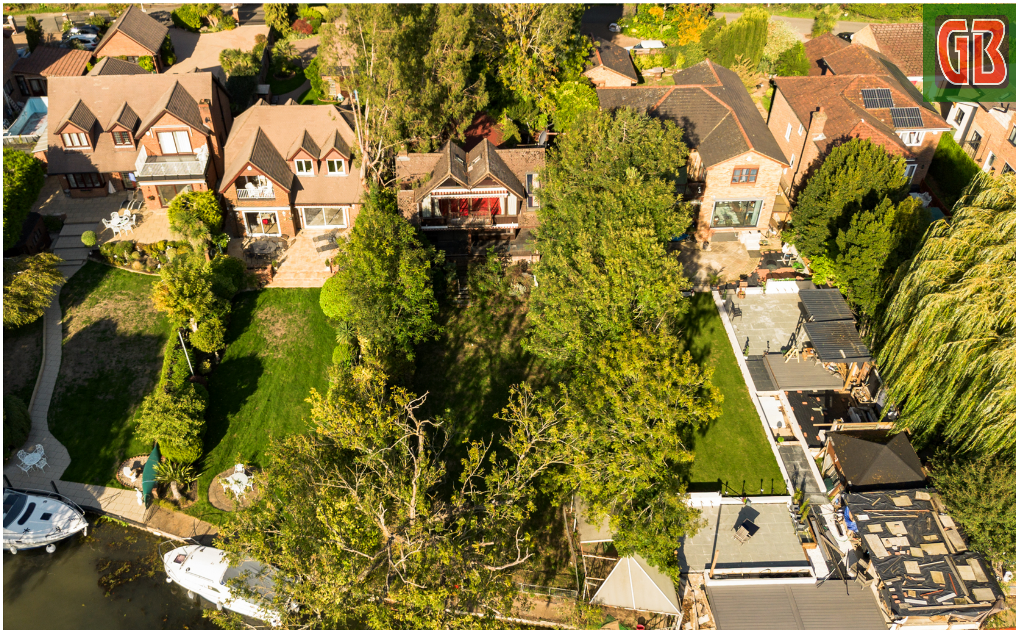
82 Hythe End Road, Wraysbury, Staines-upon-Thames, Berkshire. TW19 5AP. 4 Bedroom Detached House - £700,000 Freehold