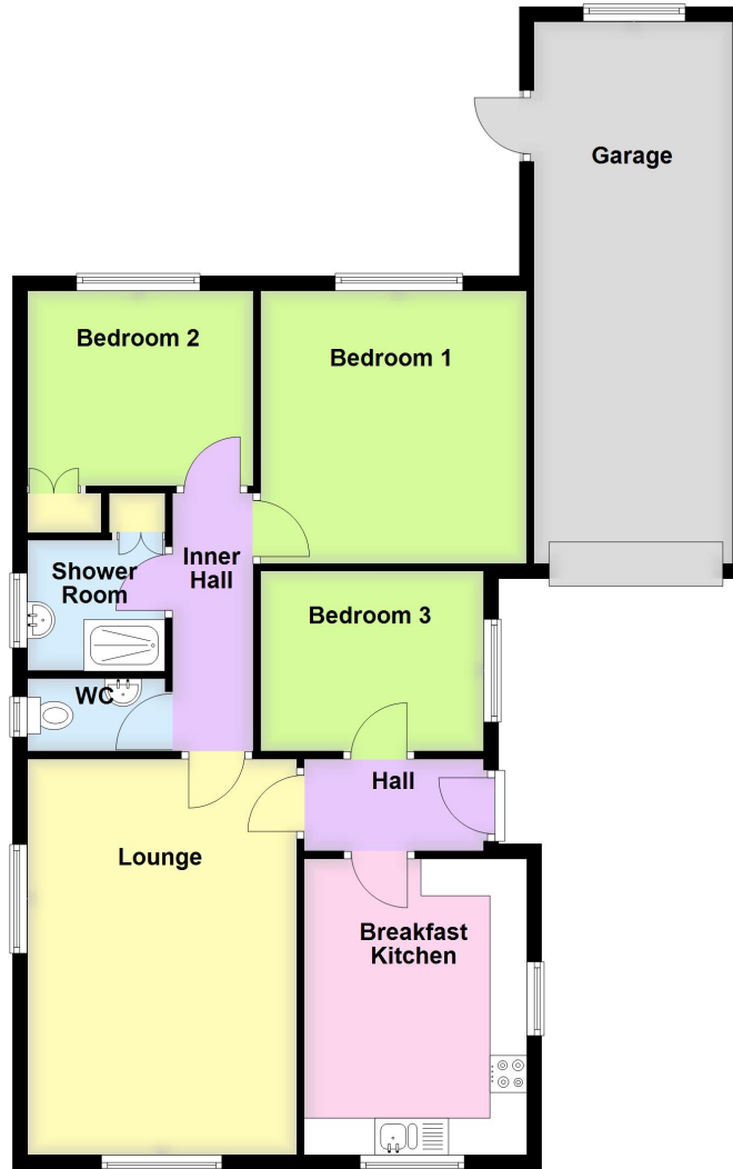
Total area: approx. 97.2 sq. metres (1046.7 sq. feet)