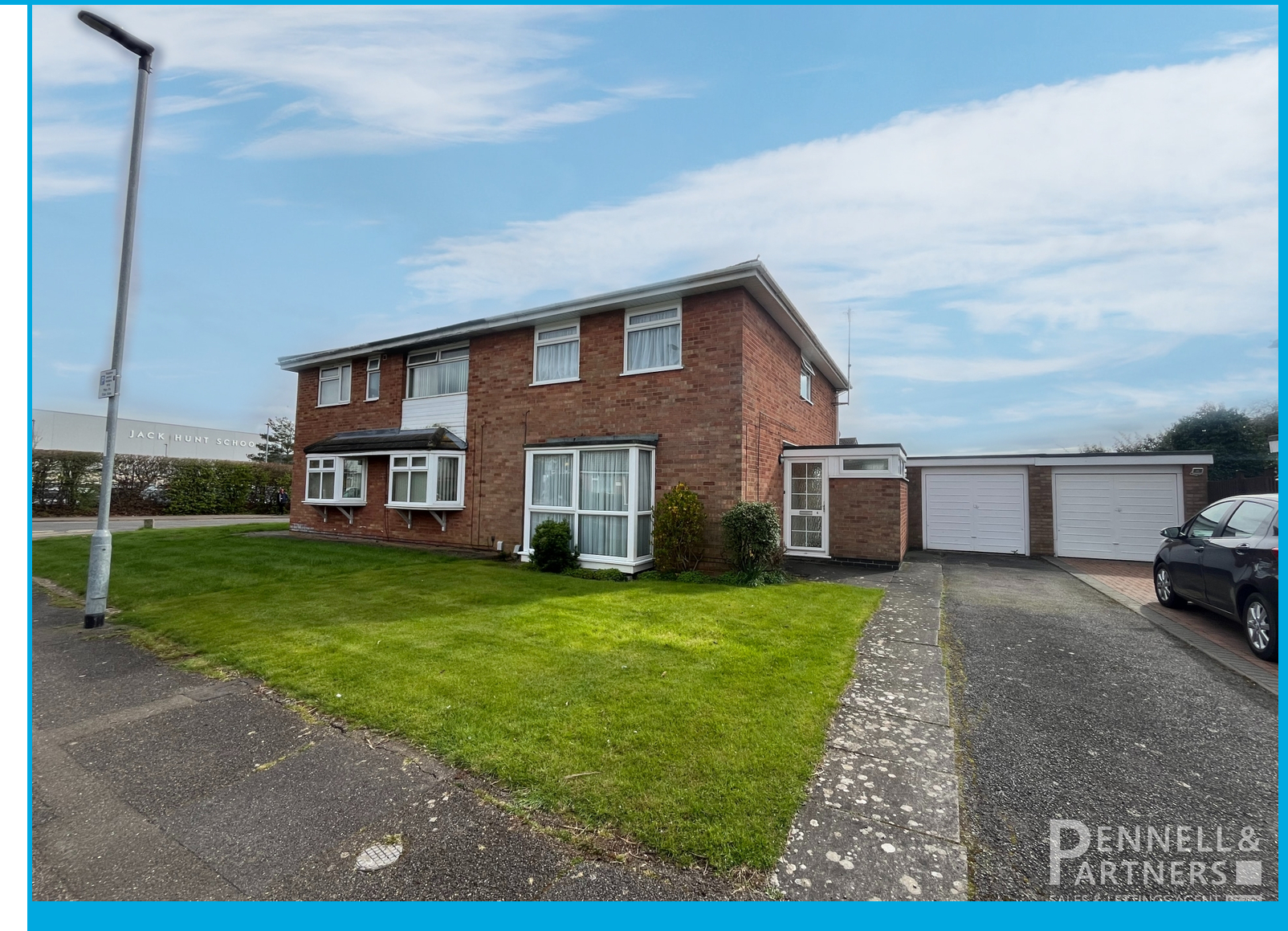
4 ELMORE ROAD, PETERBOROUGH, CAMBRIDGESHIRE. PE3 9PT