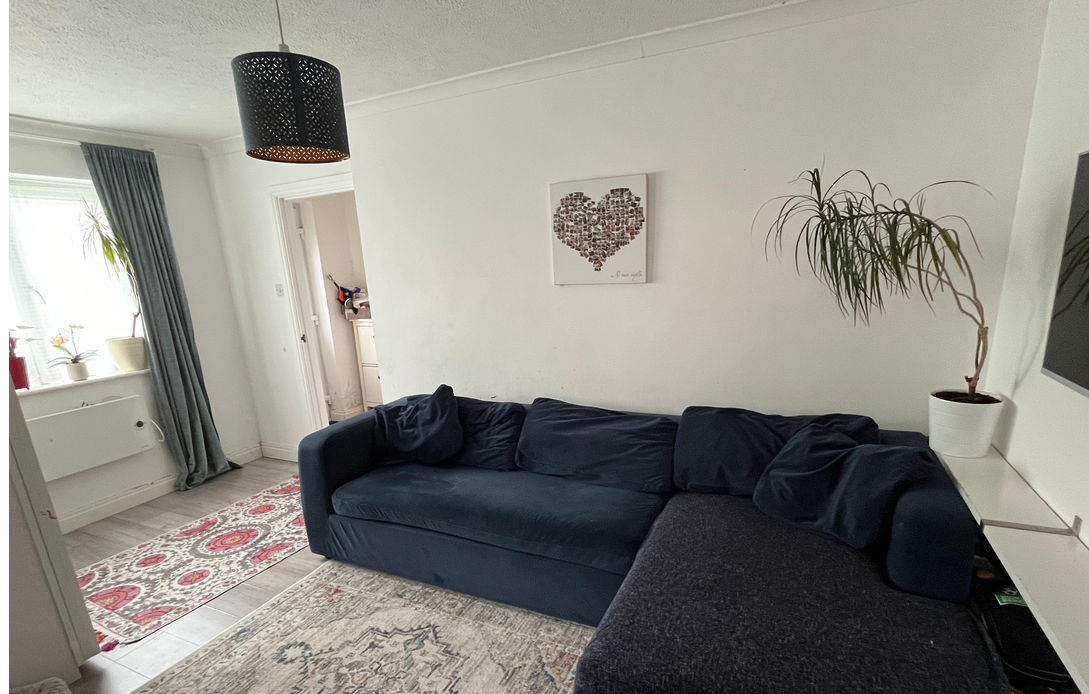
8 Canterbury Court, Chaucer Road, Ashford, Surrey TW15 2PT £209,950 - Leasehold