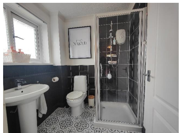
EN-SUITE TO BEDROOM 3