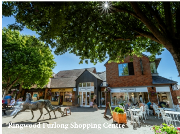
Ringwood Furlong Shopping Centre