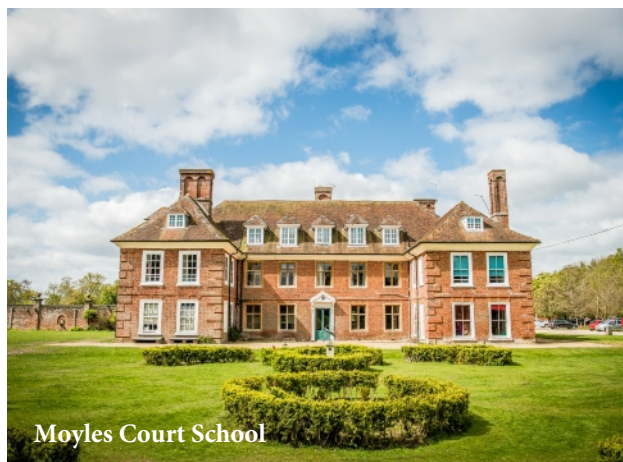
Moyles Court School