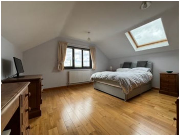
Rear Bedroom 5