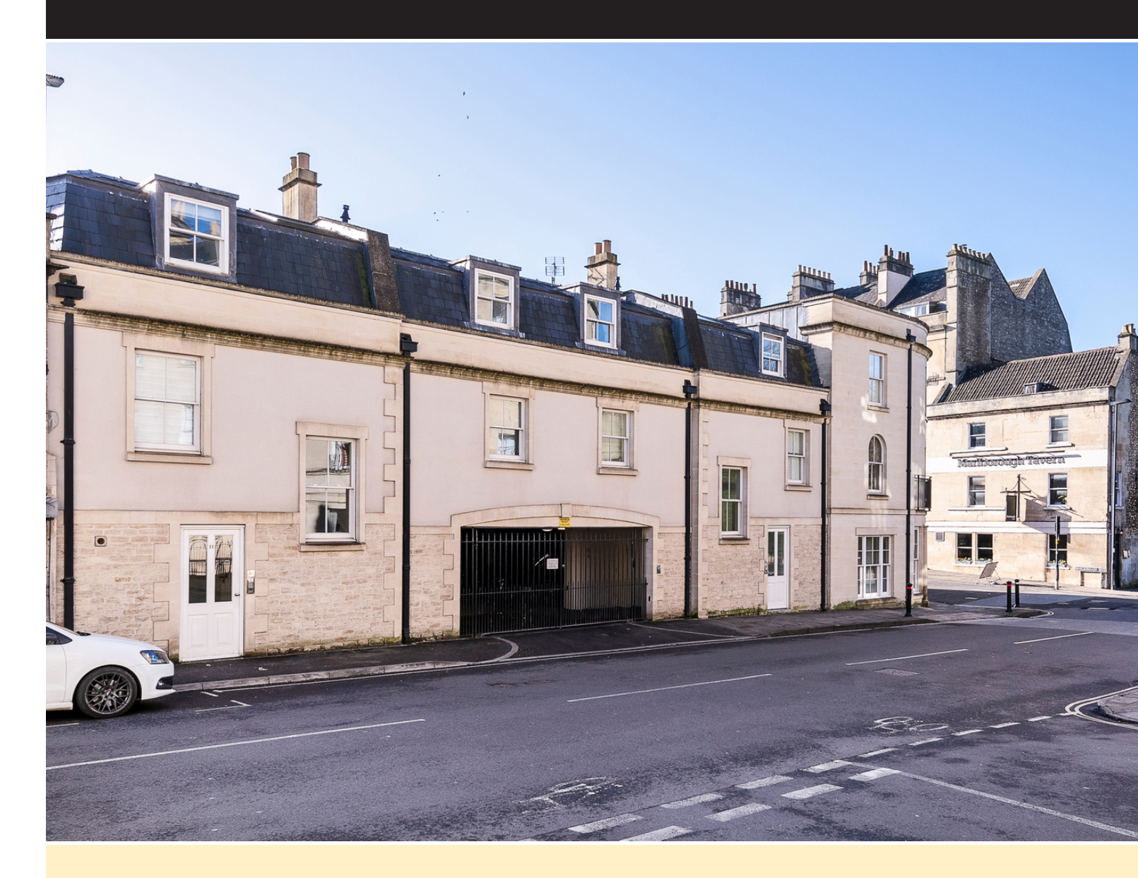
Crescent Lane, Bath