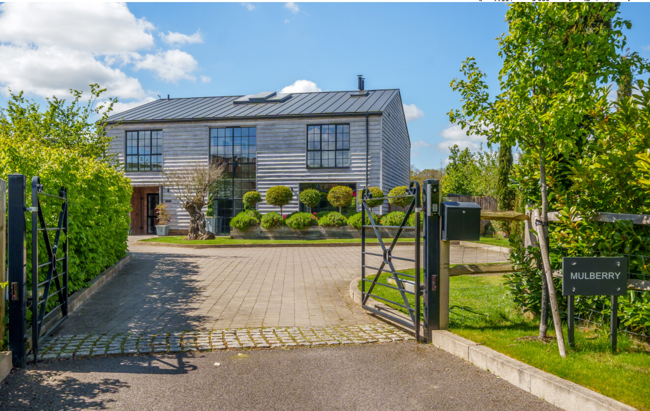
Mulberry, Pitt Lane, Frensham, Farnham, Surrey. GU10 3EF. Guide Price £2,250,000

Approximate Floor Area = 326.2 aq m / 3511 aq ft Store = 1.5 aq m / 16 aq ft Total = 327.7 aq m / 3527 aq ft