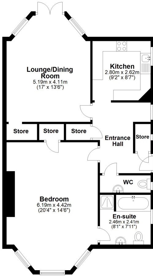
Total area: approx. 74.5 sq. metres (801.8 sq. feet)

Whilst every attempt has been made to ensure the accuracy of the floor plan contained here, measurements of doors, windows, rooms and any other items are approximate and no responsibility is taken for any error, omission or mis-statement. This plan is for illustrative purposes only and should be used as such by any prospective purchaser. Plan produced using Plan Ib