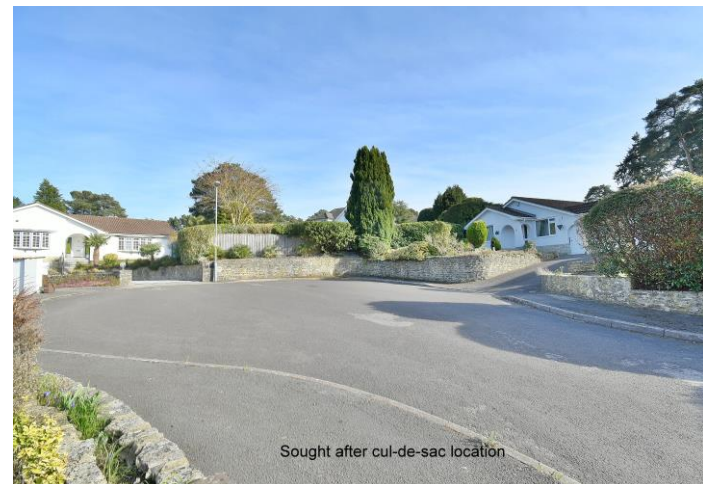
Sought after cul-de-sac location